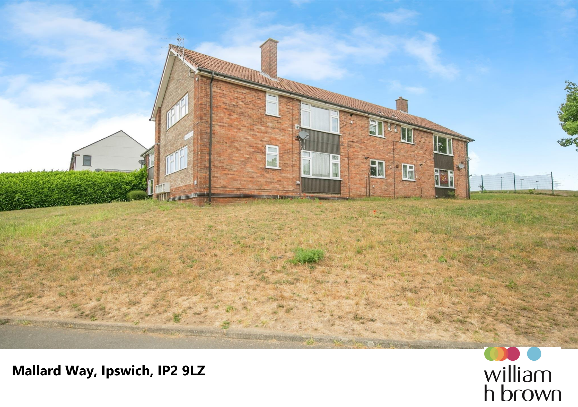
Mallard Way, Ipswich, IP2 9LZ