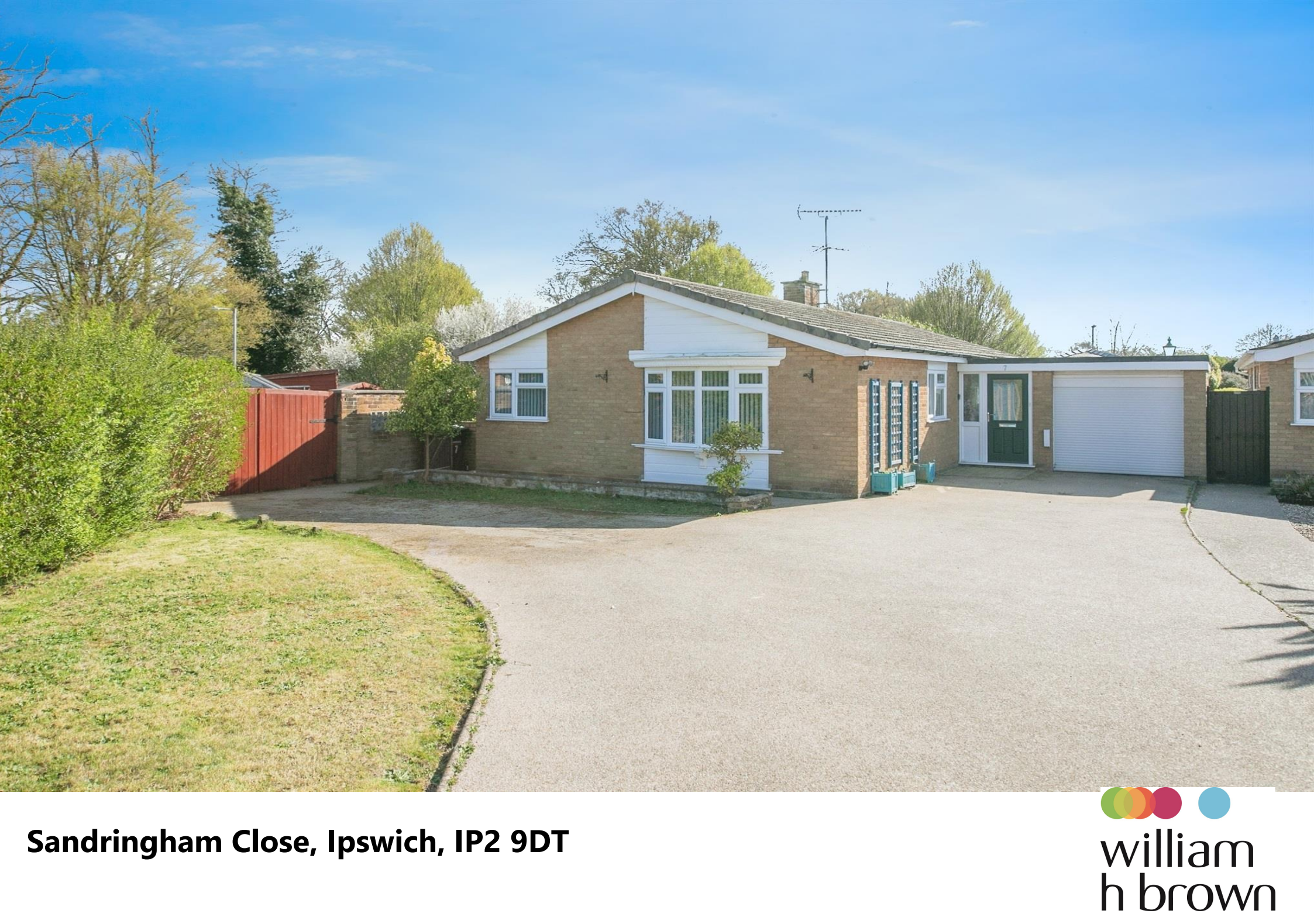
Sandringham Close, Ipswich, IP2 9DT