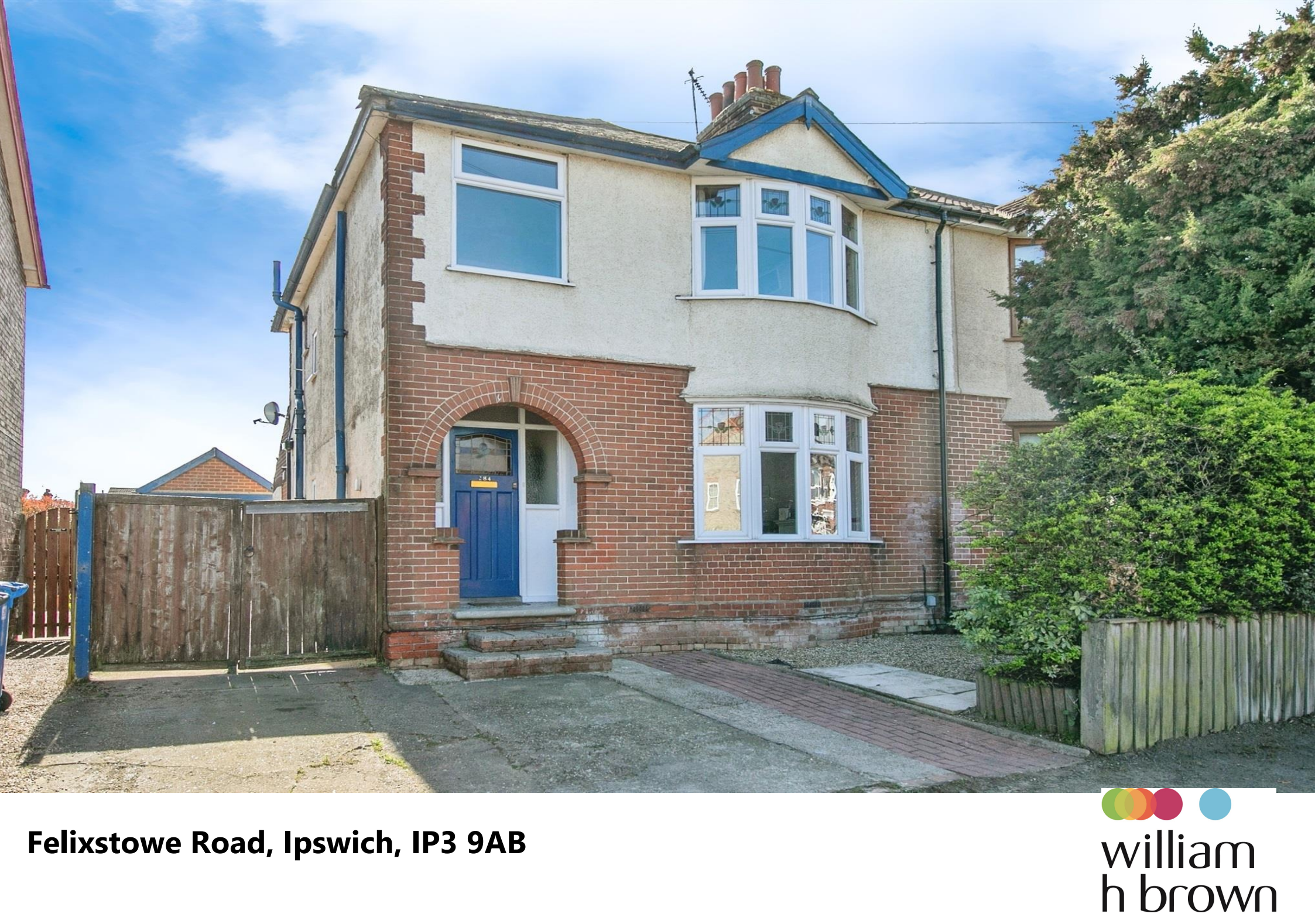
Felixstowe Road, Ipswich, IP3 9AB