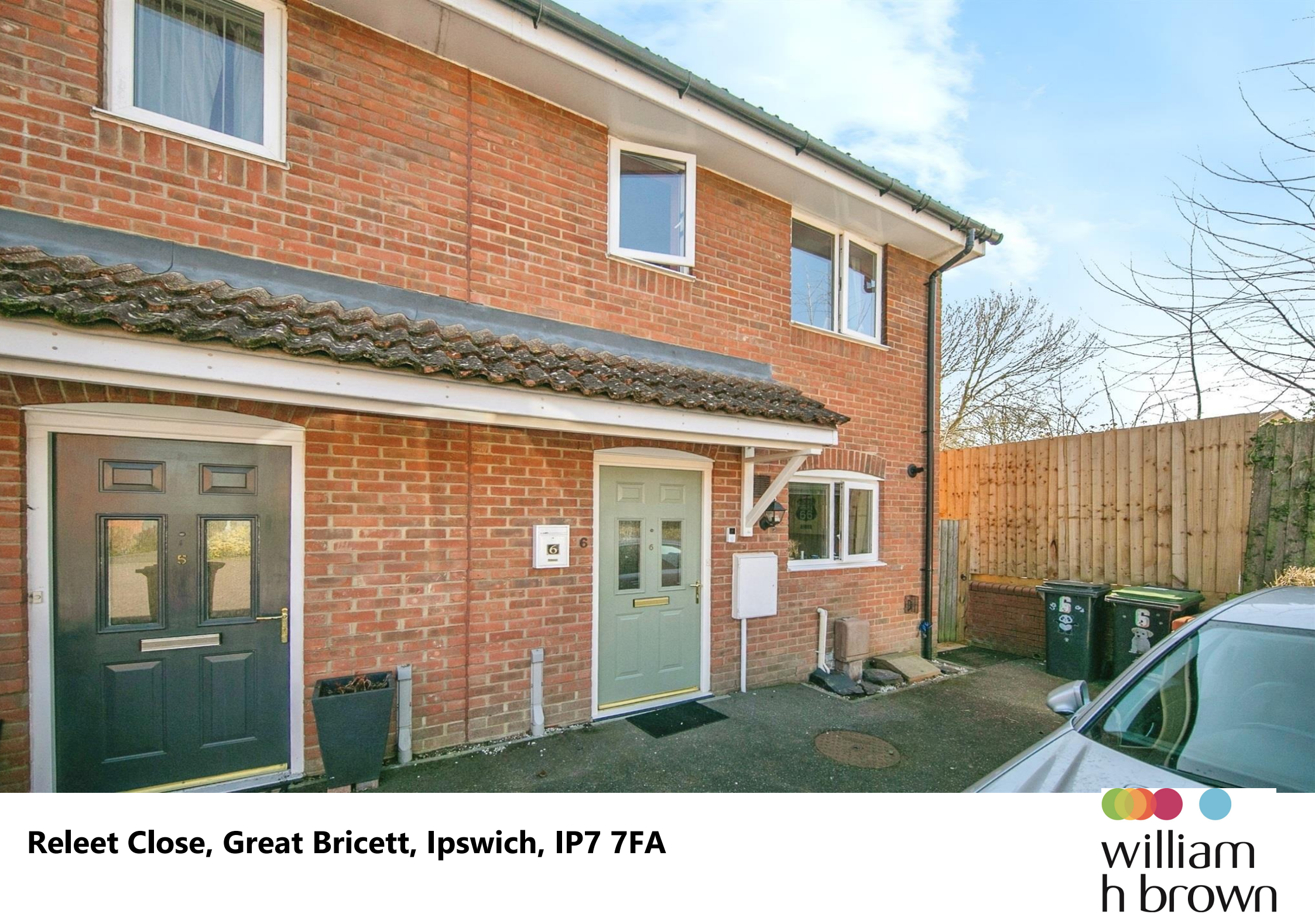
Releet Close, Great Bricett, Ipswich, IP7 7FA