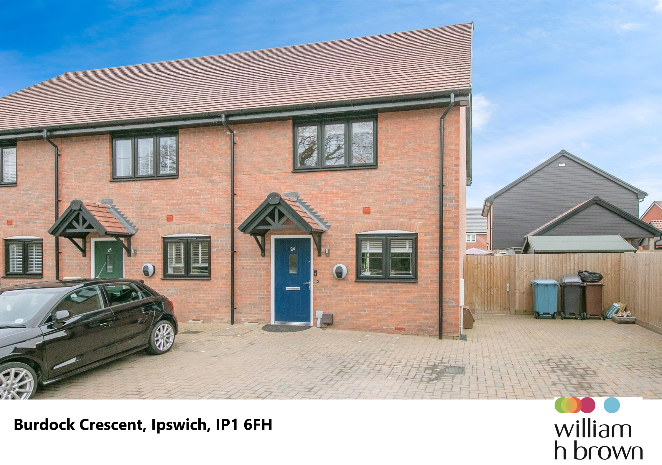
Burdock Crescent, Ipswich, IP1 6FH