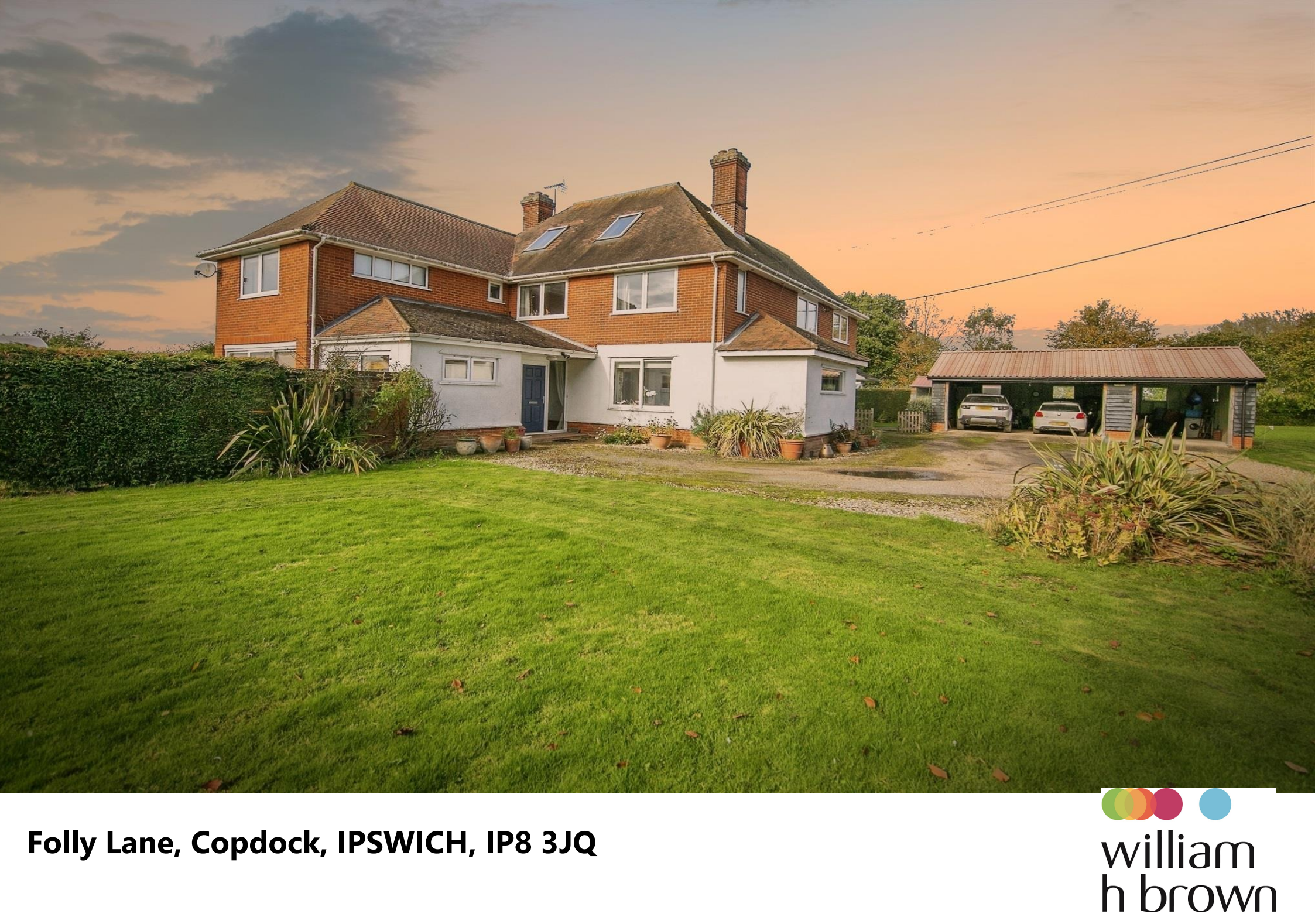
Folly Lane, Copdock, IPSWICH, IP8 3JQ