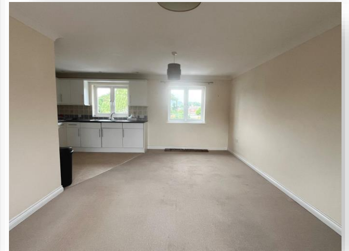
Lime Tree Place, Ipswich, IP1 5FA