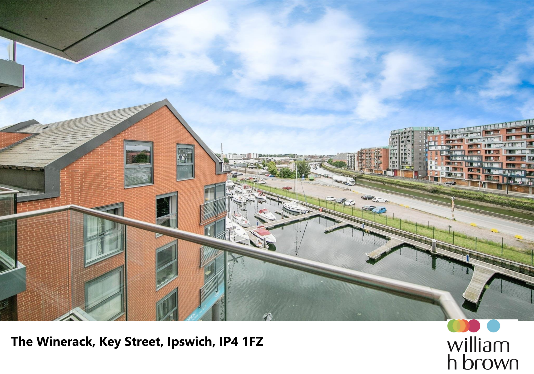
The Winerack, Key Street, Ipswich, IP4 1FZ