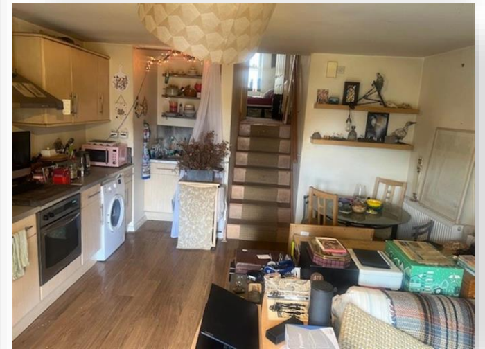
Flat 11, Stoke Street, Ipswich, IP2 8BX