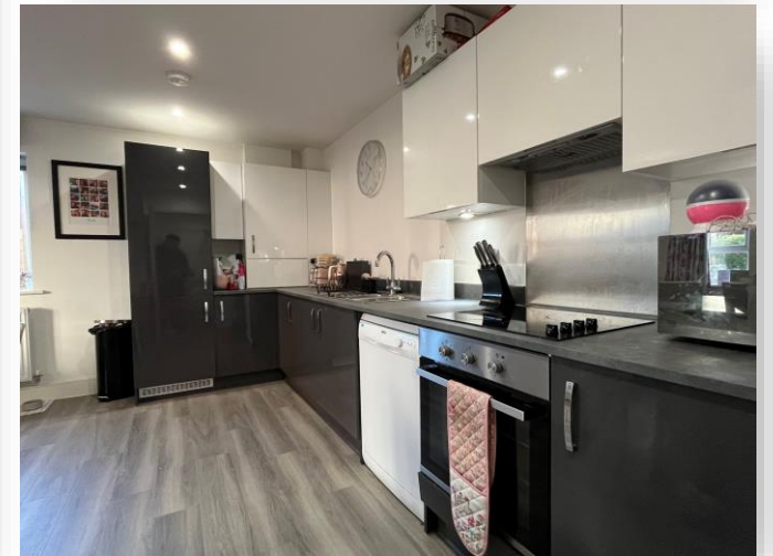
Mimas Way, Ipswich, IP1 5FD