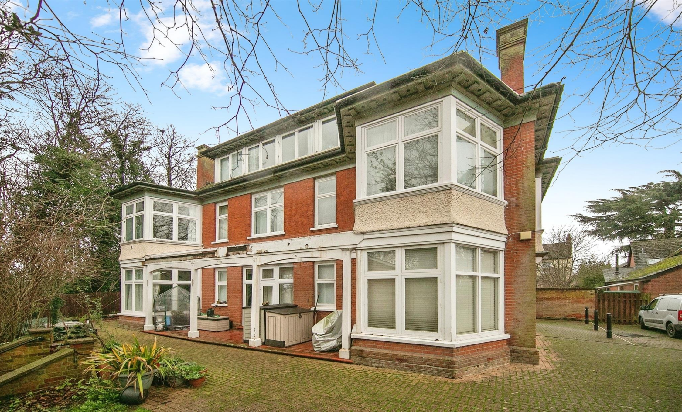
Montrose Court, Rosehill Crescent, IPSWICH, IP3 8ER