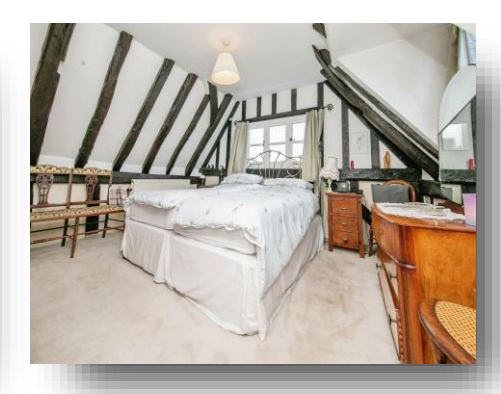
Weyland Rd Coopers Co