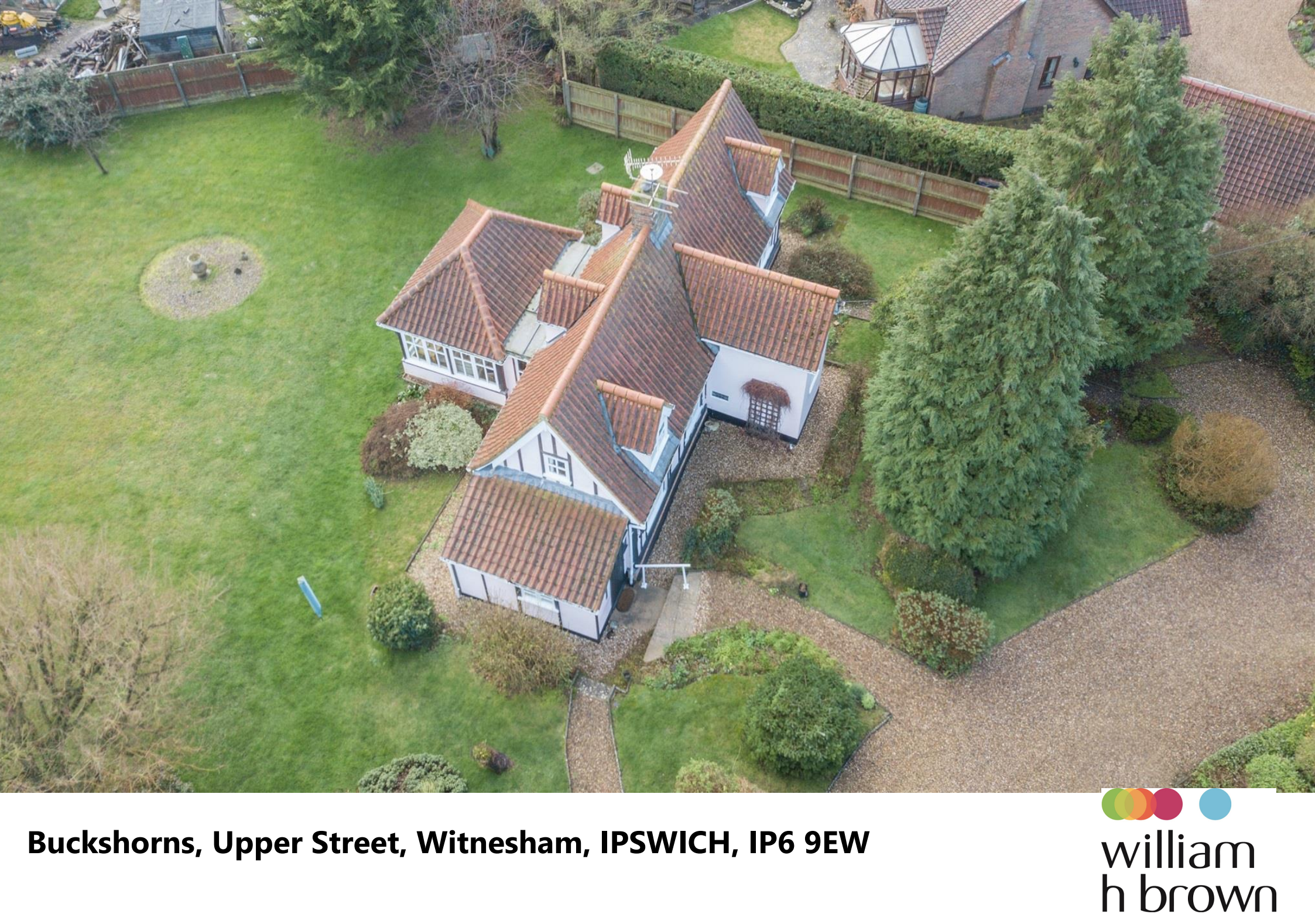
Buckshorns, Upper Street, Witnesham, IPSWICH, IP6 9EW