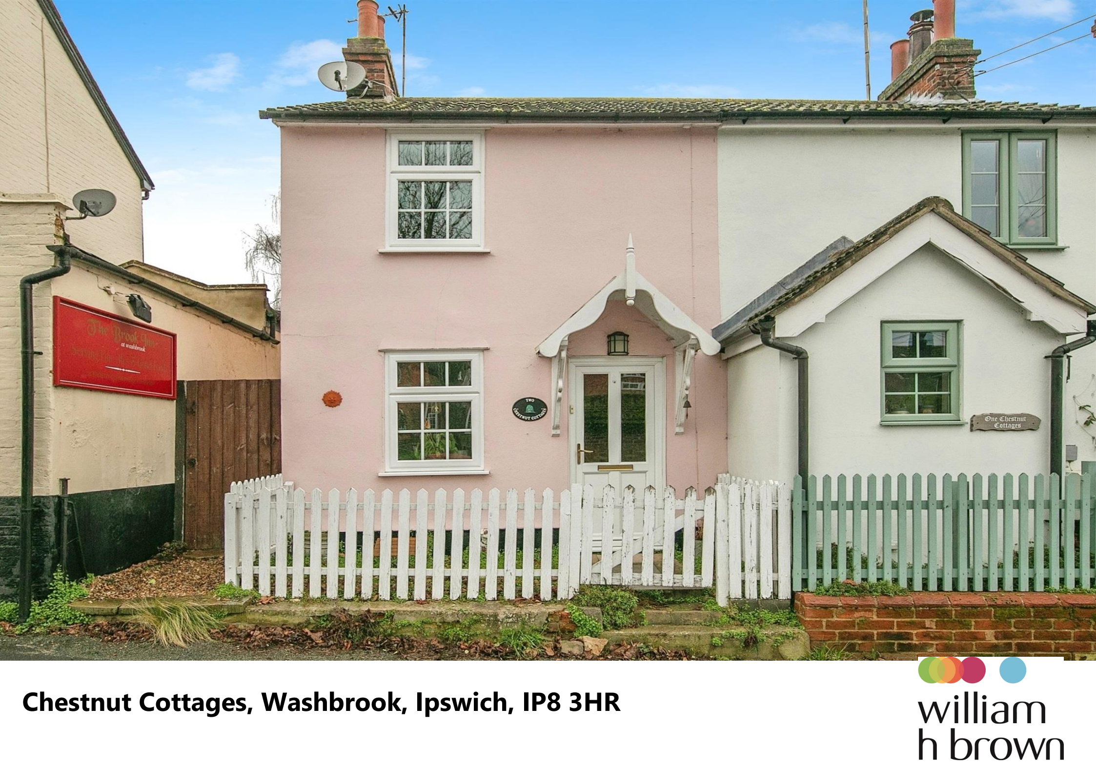
Chestnut Cottages, Washbrook, Ipswich, IP8 3HR