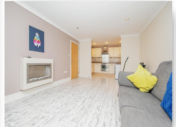
Patteson Road, Ipswich, IP3 0BB