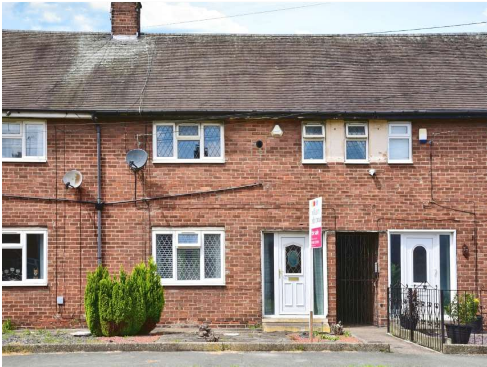
Barnsley Street, Hull, HU8 7SZ