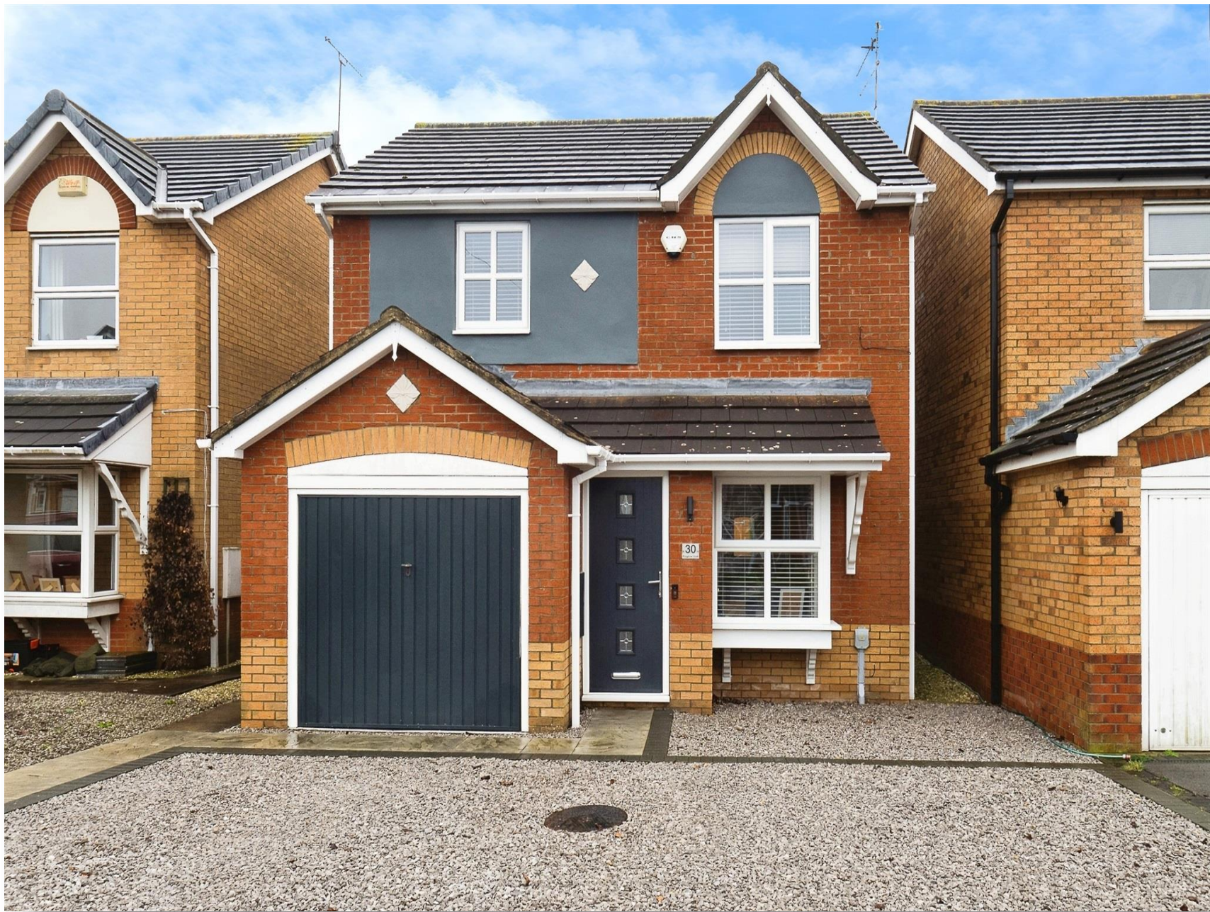
Foxglove Close, Kingswood, Hull, HU7 3HD