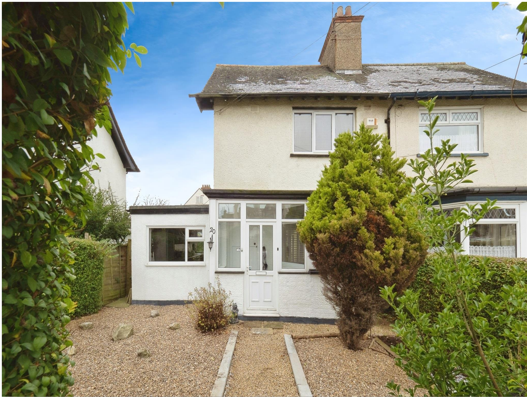
Lilac Avenue, Garden Village, Hull, HU8 8PT