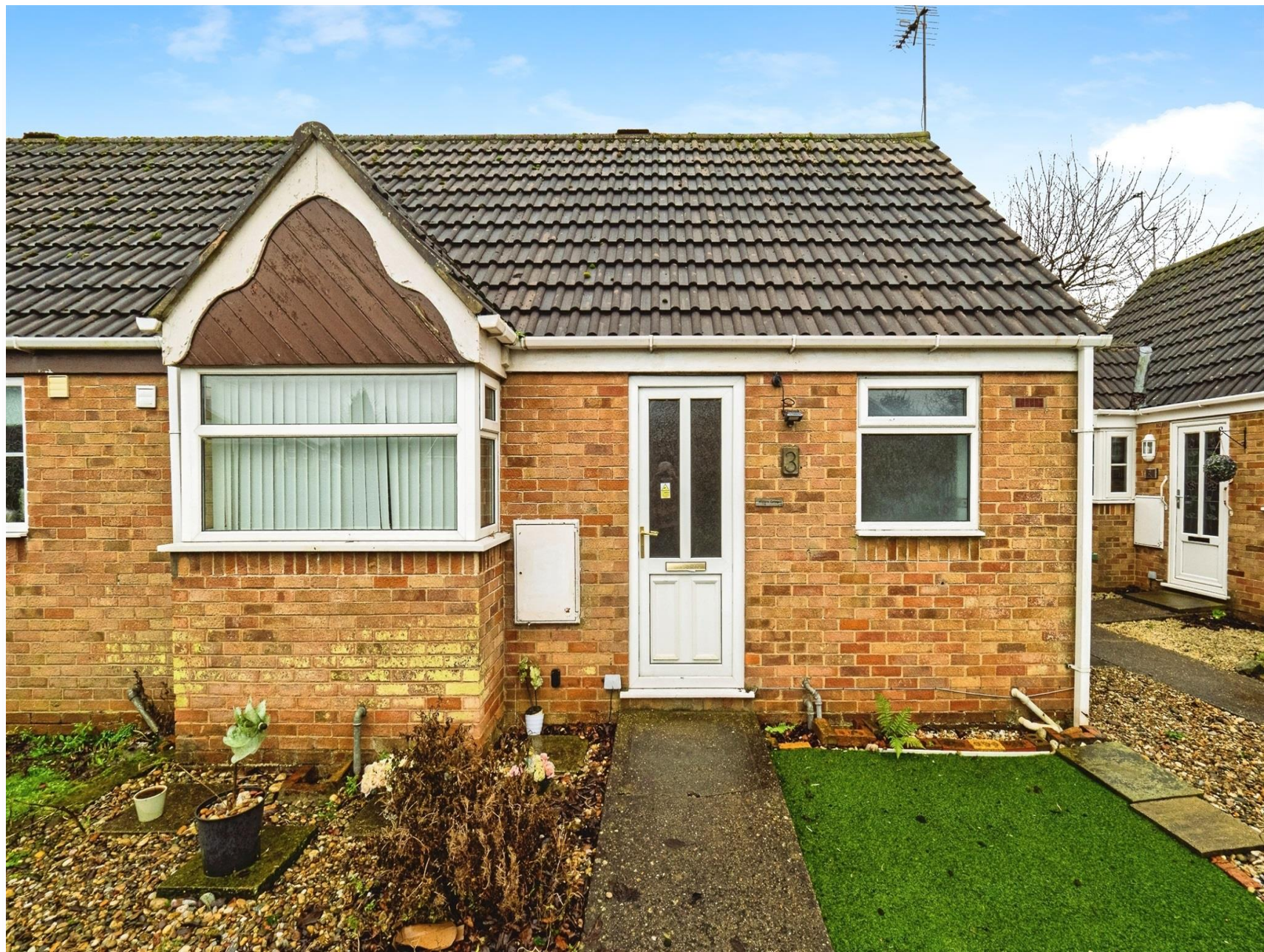
3 The Poplars Church Lane, Thorngumbald, Hull, HU12 9PA