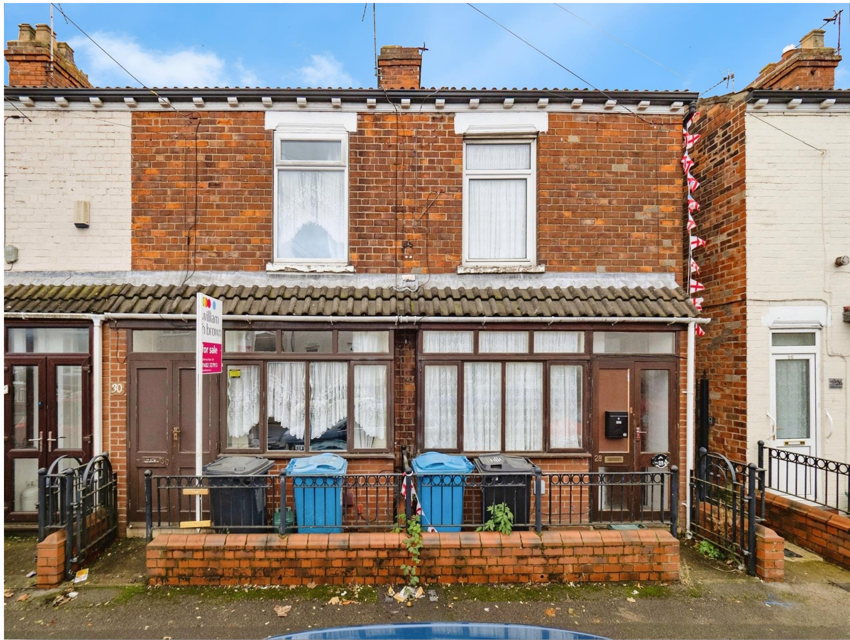
Belmont Street, Hull, HU9 2RL