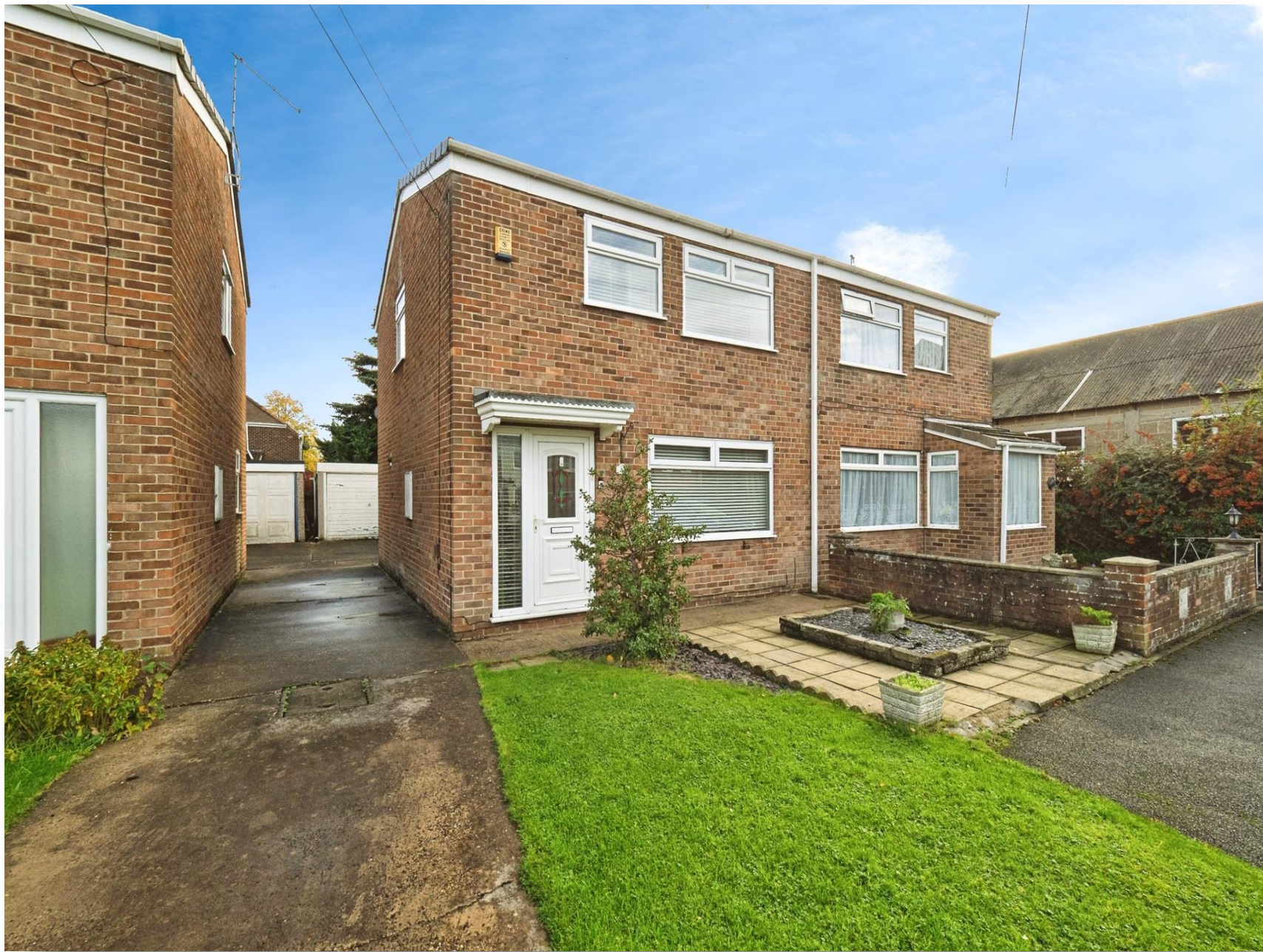
Truro Close, Sutton-On-Hull, Hull, HU7 4XQ