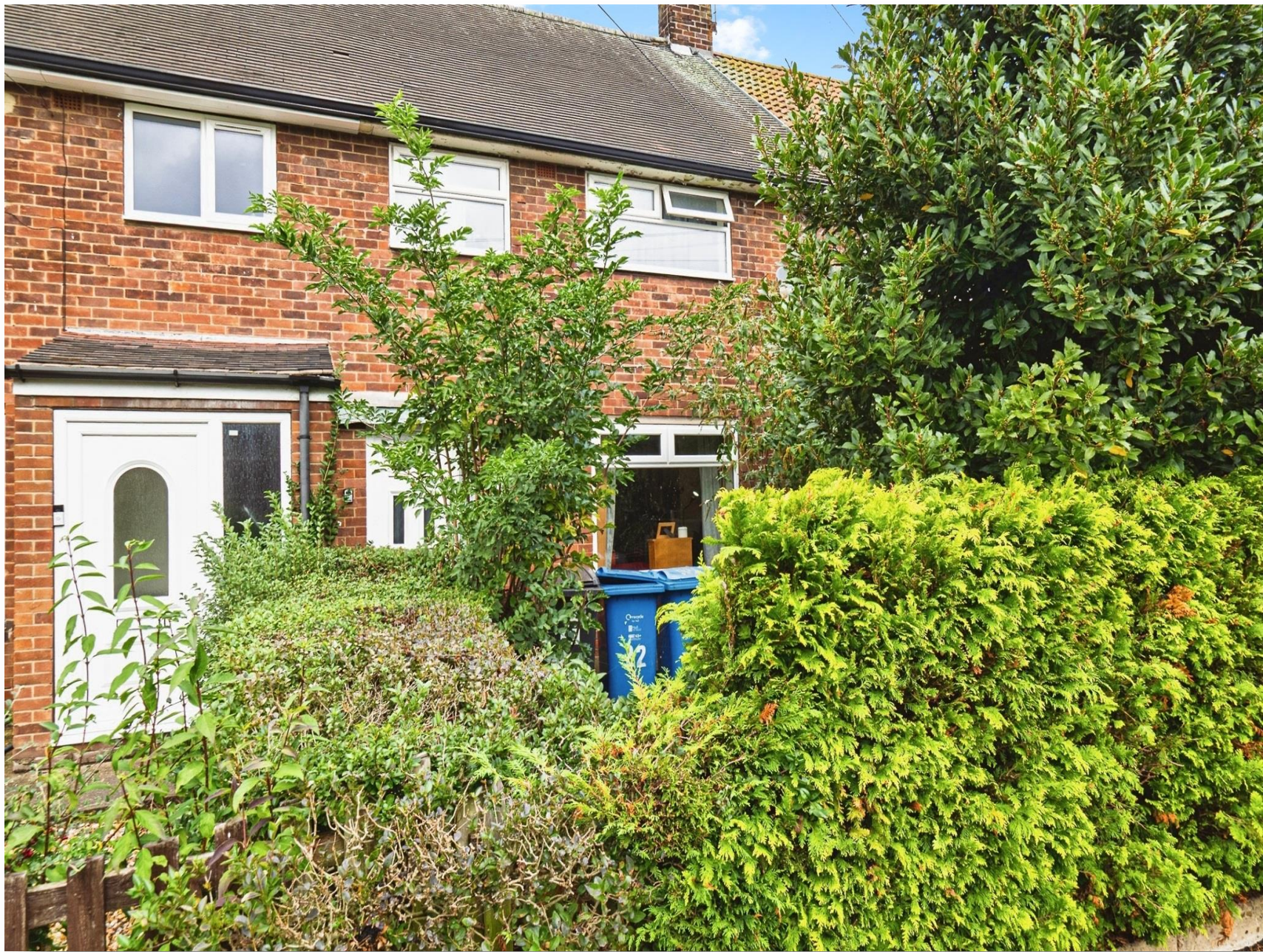
Foxhill Close, HULL, HU9 4LP