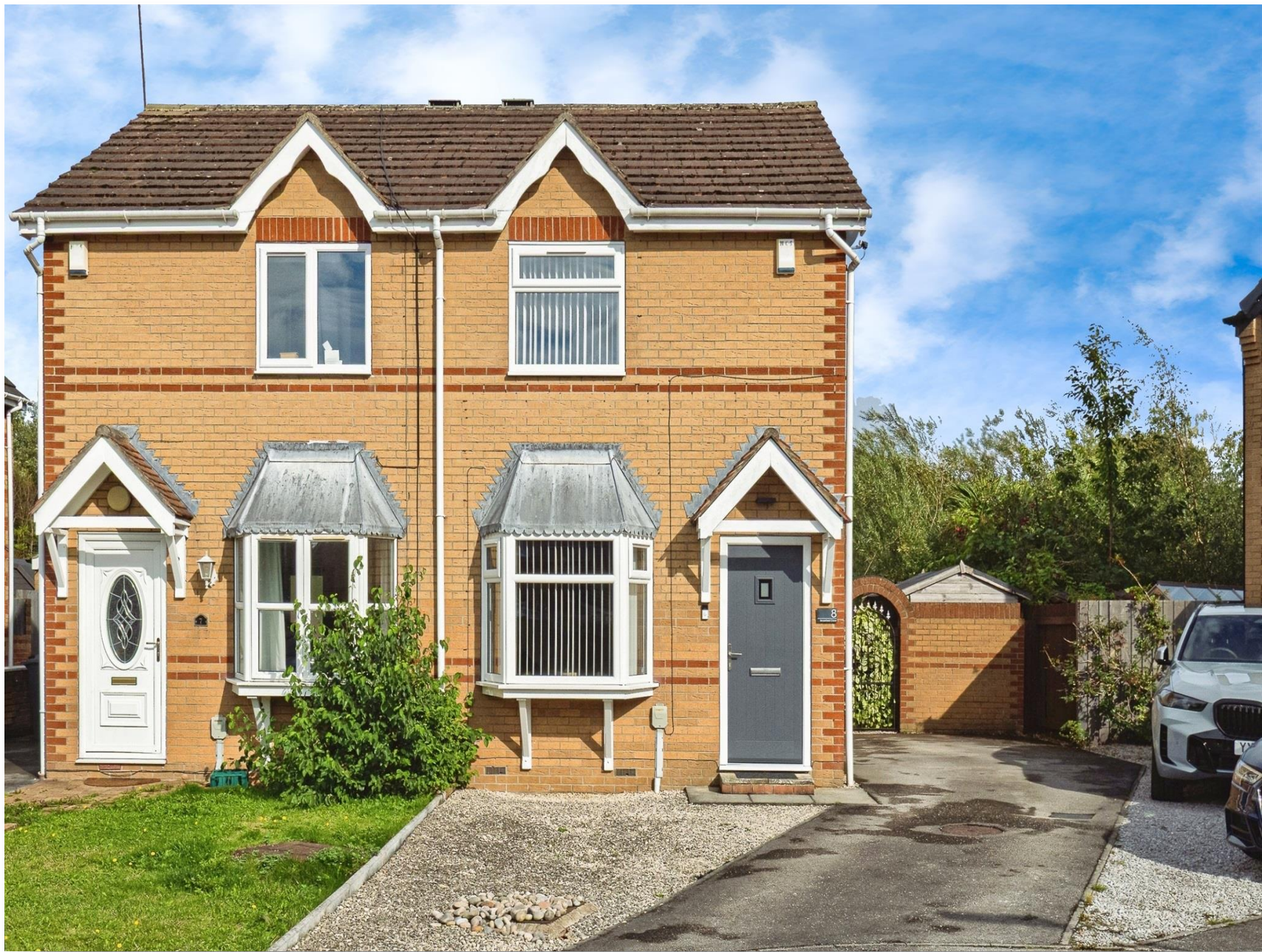
Brookfield Close, Kingswood, Hull, HU7 3EX