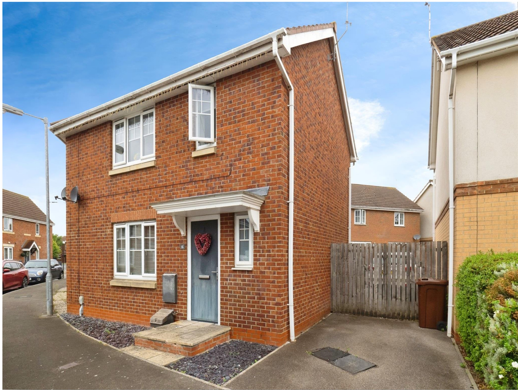
Pasture View, Kingswood, Hull, HU7 3AH