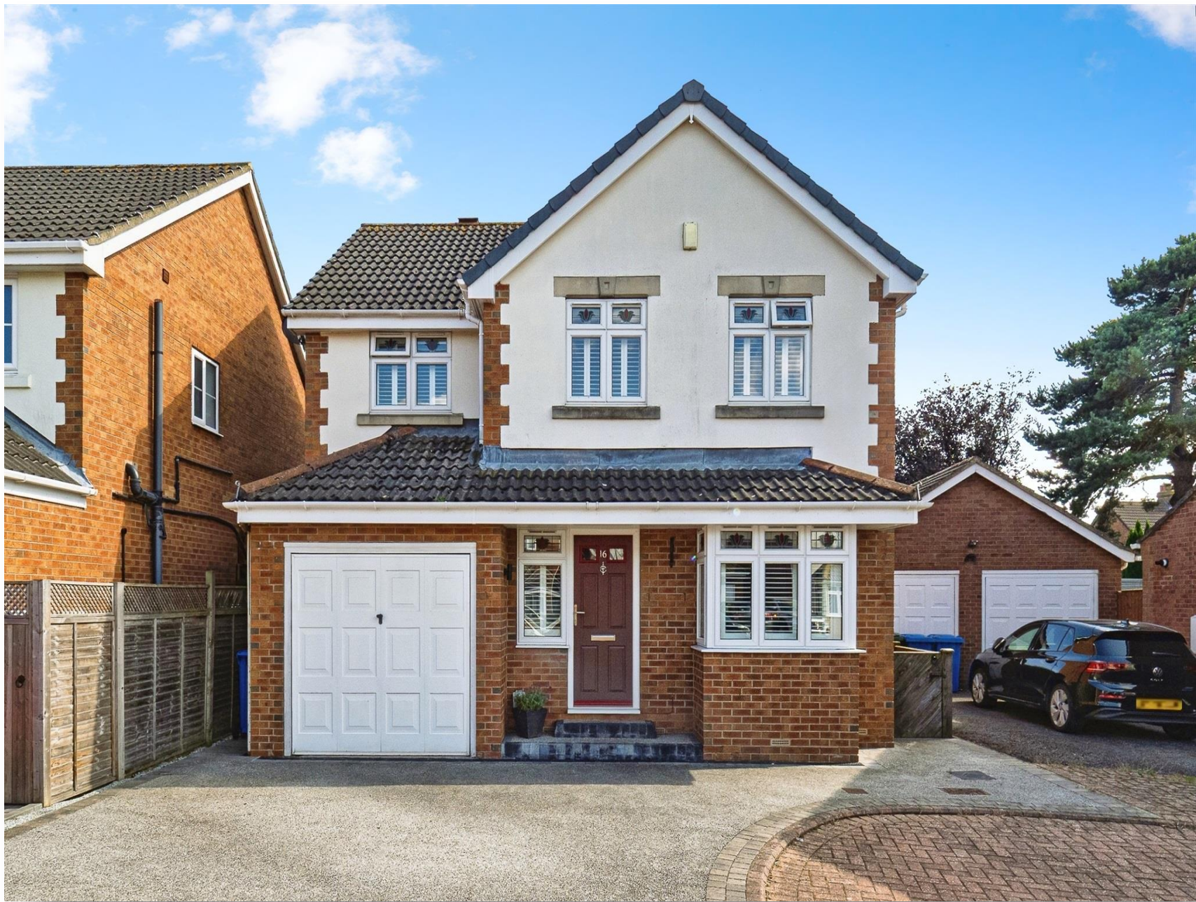
Cherry Tree Close, Bilton, Hull, HU11 4EZ