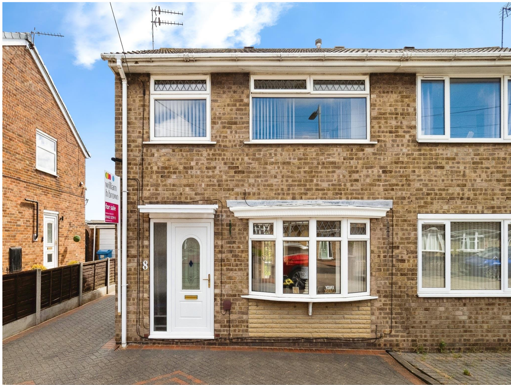
Grenville Bay, Bilton, Hull, HU11 4BZ