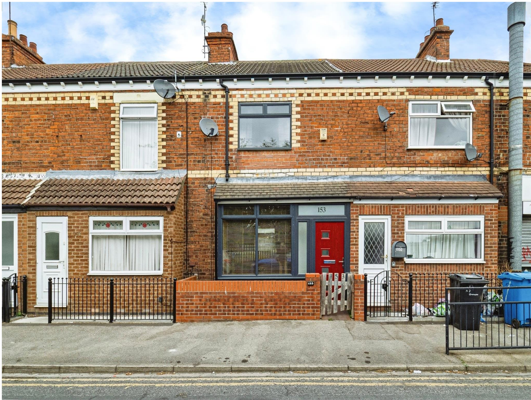
Rosmead Street, Hull, HU9 2TA