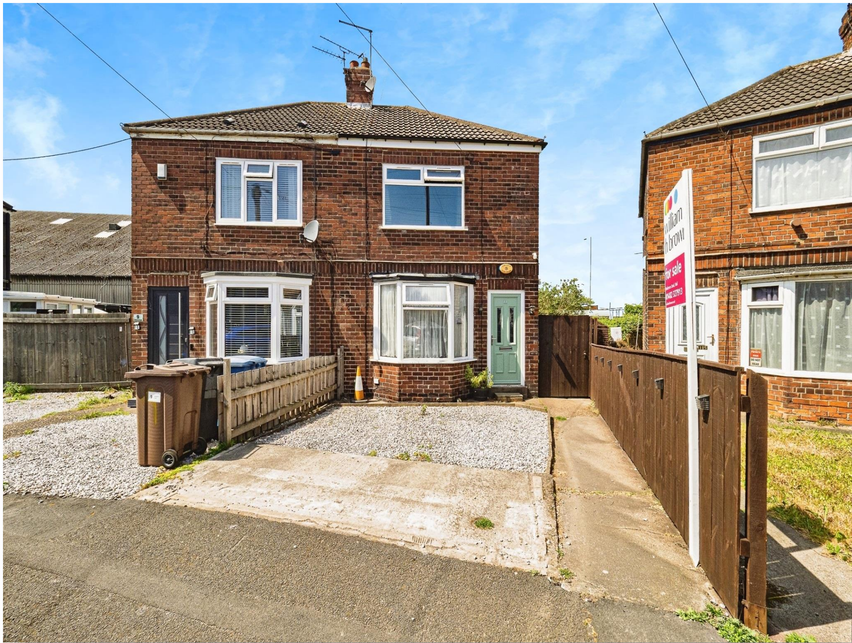
Kathleen Road, Hull, HU8 8EB