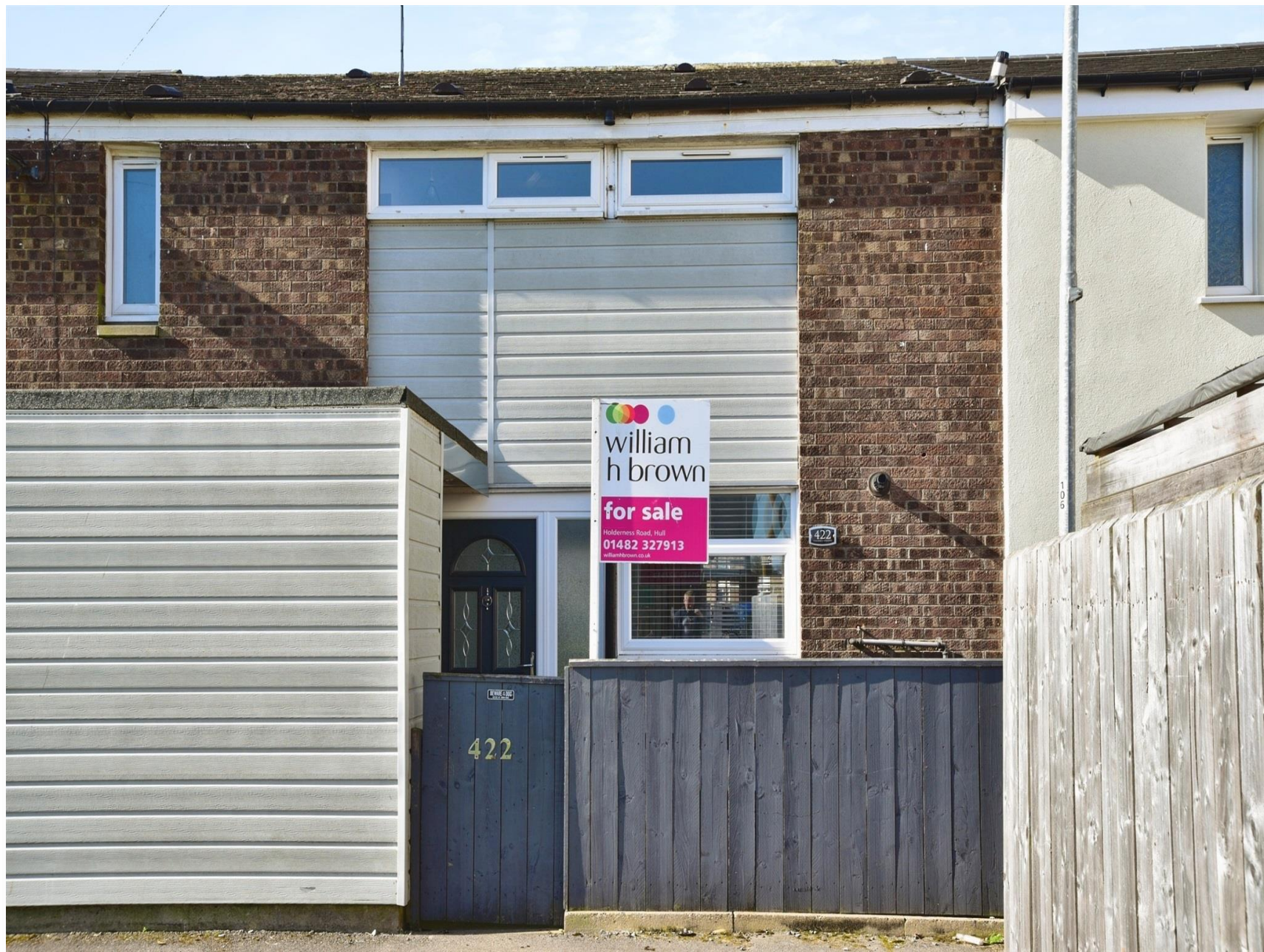
Stroud Crescent East, Bransholme, Hull, HU7 4QW