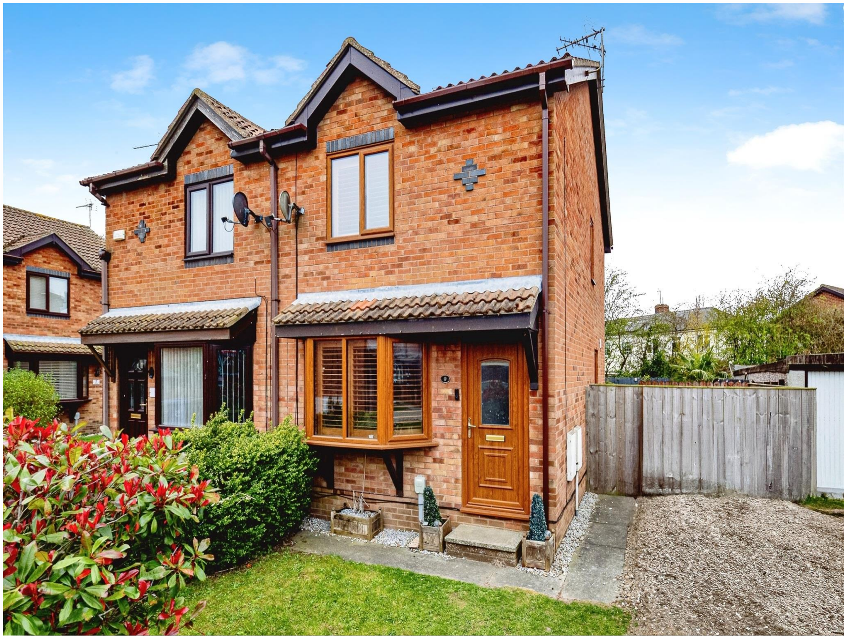
Garbutt Close, Preston, Hull, HU12 8XZ