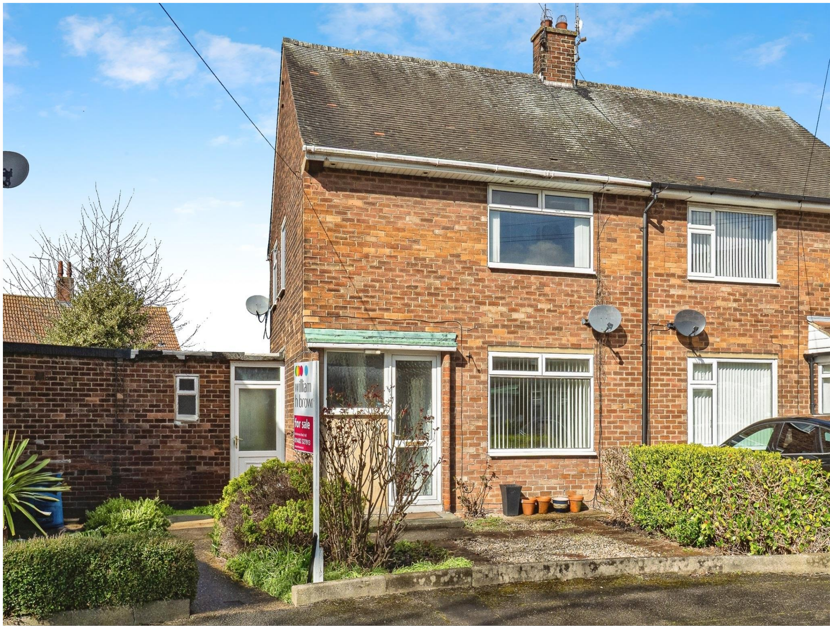
Thornhill Avenue, Hull, HU8 0EU