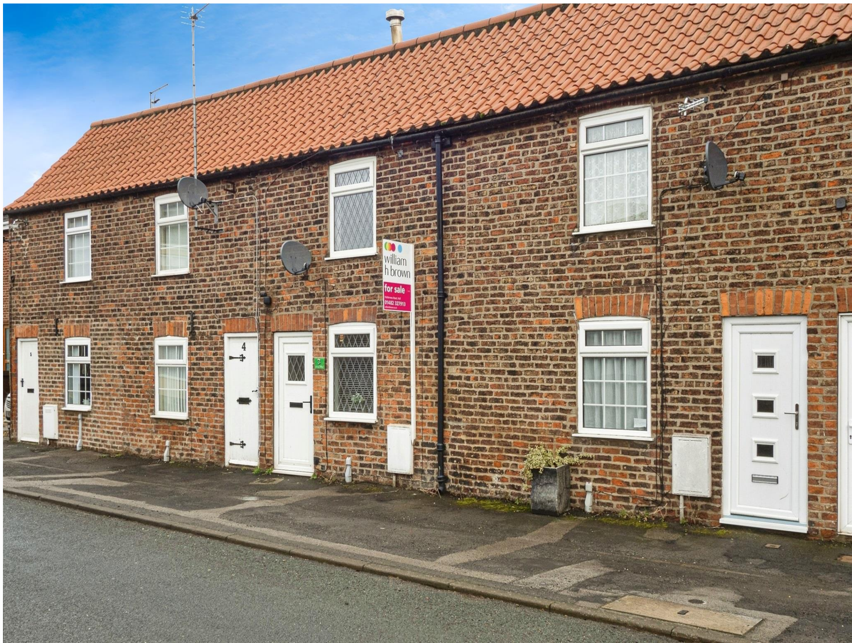
Wrays Cottages, Burstwick, Hull, HU12 9EU