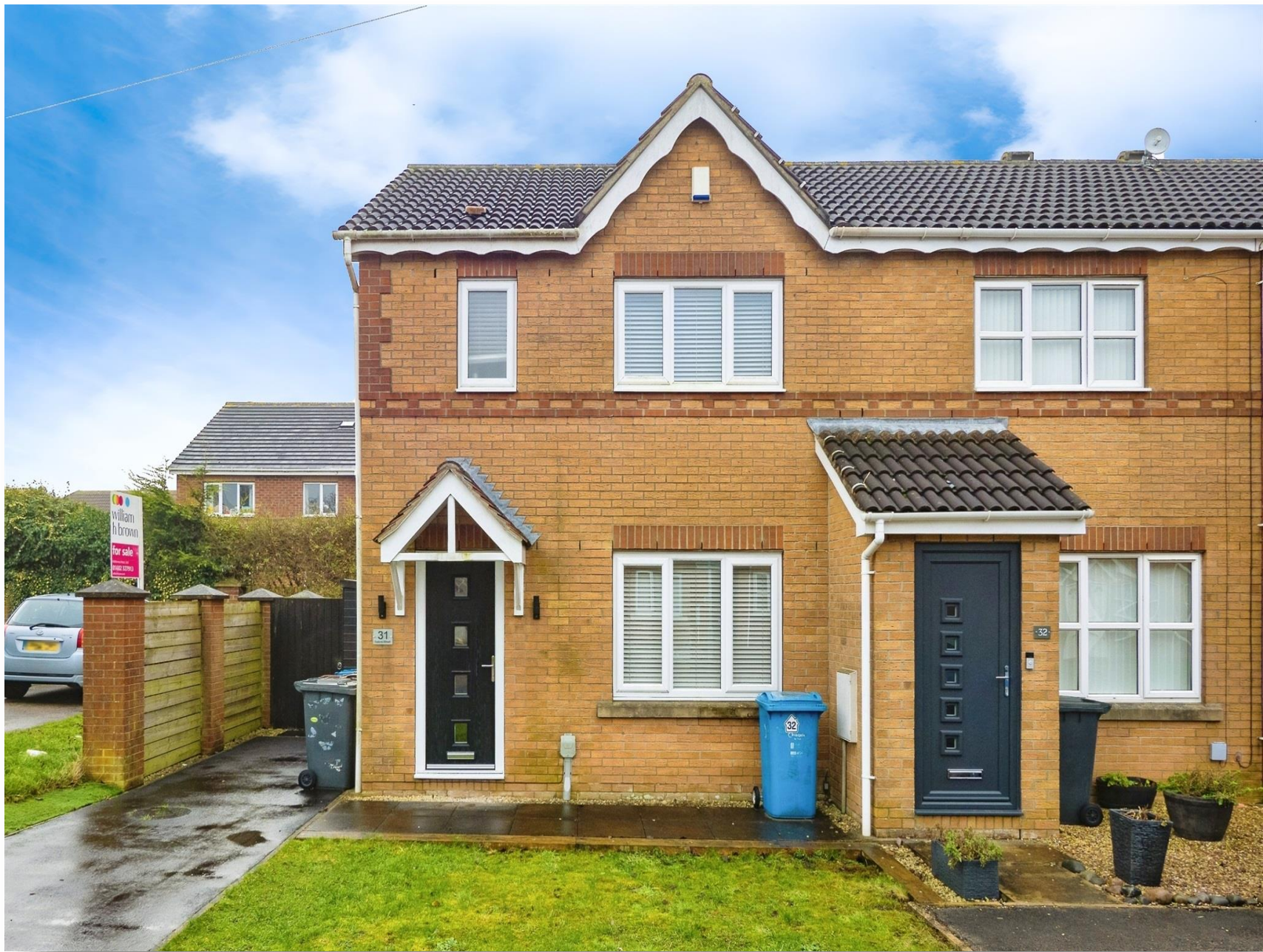
Sailors Wharf, Hull, HU9 1UJ