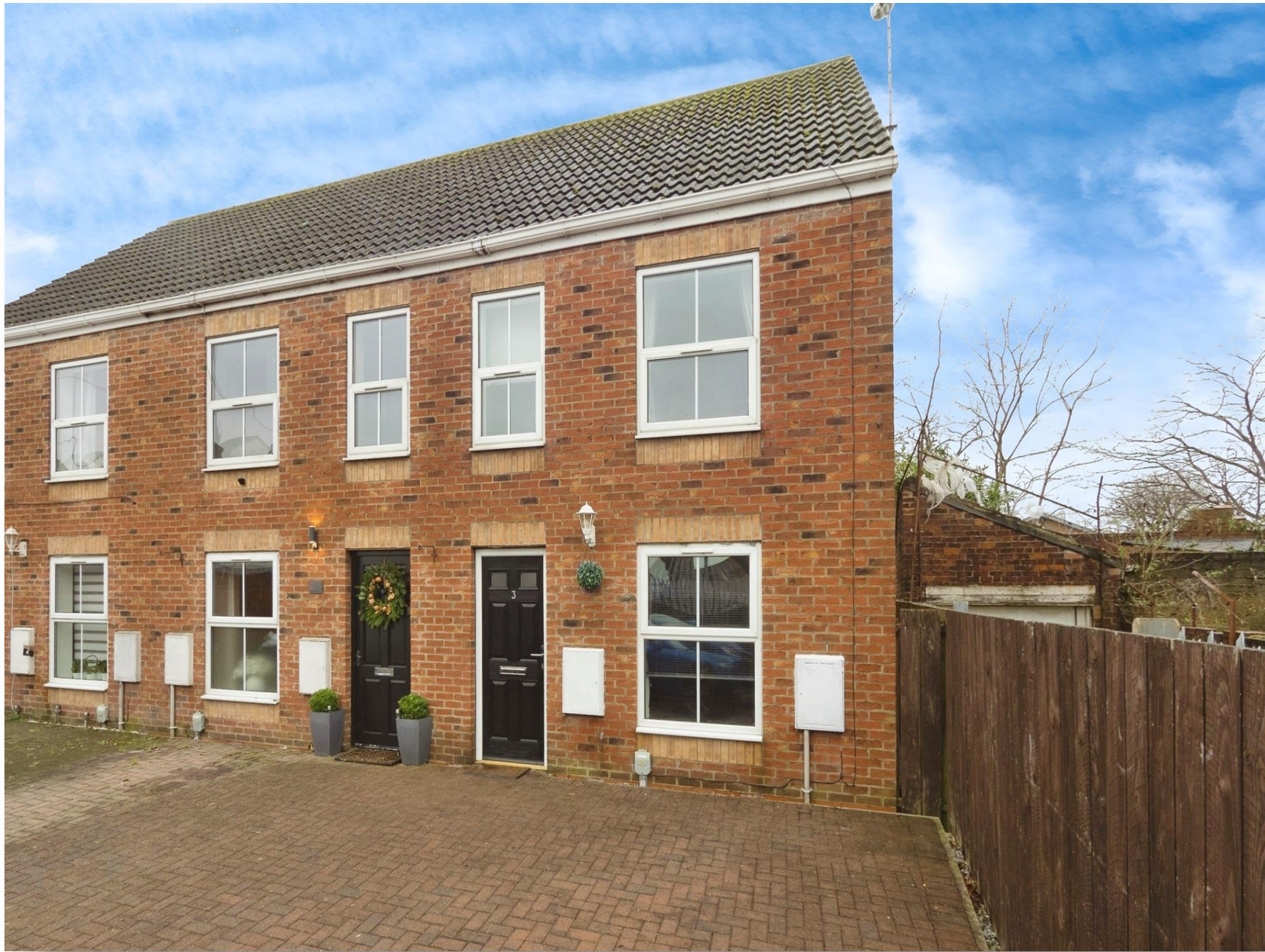
Arnold Mews, Hull, HU9 3LL