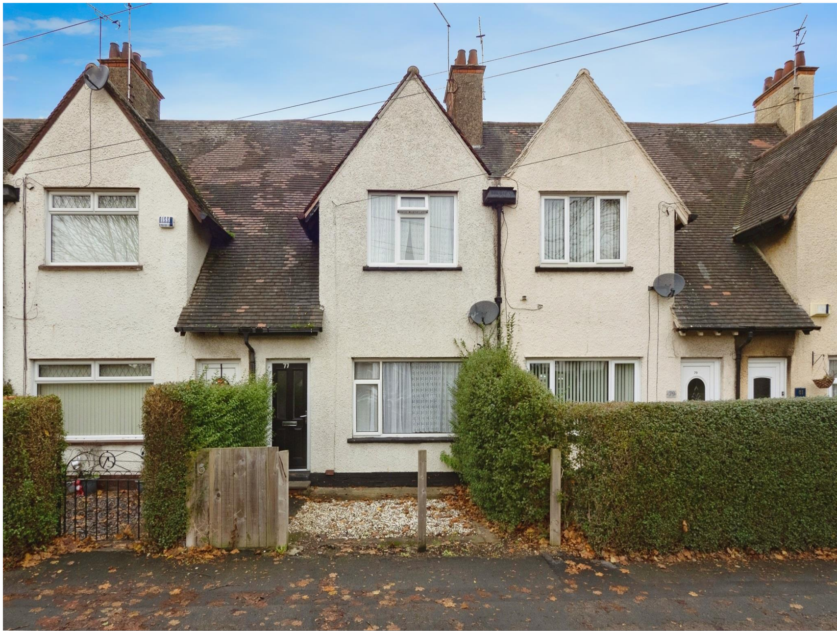
James Reckitt Avenue, Hull, HU8 7TJ