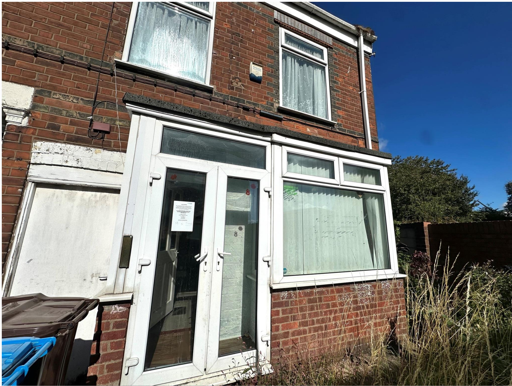
Egton Villas, Hull, HU8 7HT