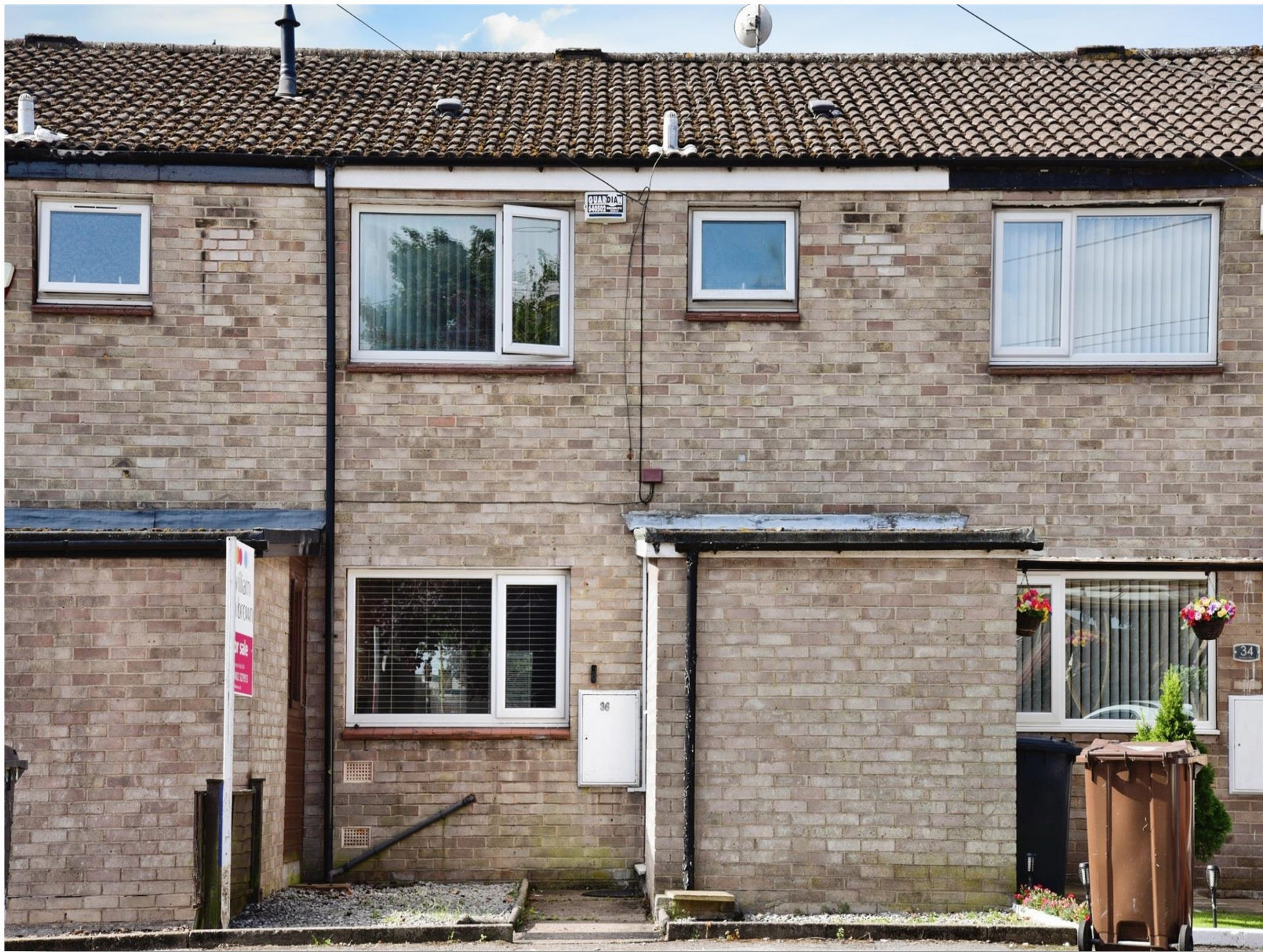
Acacia Drive, Hull, HU8 8PB