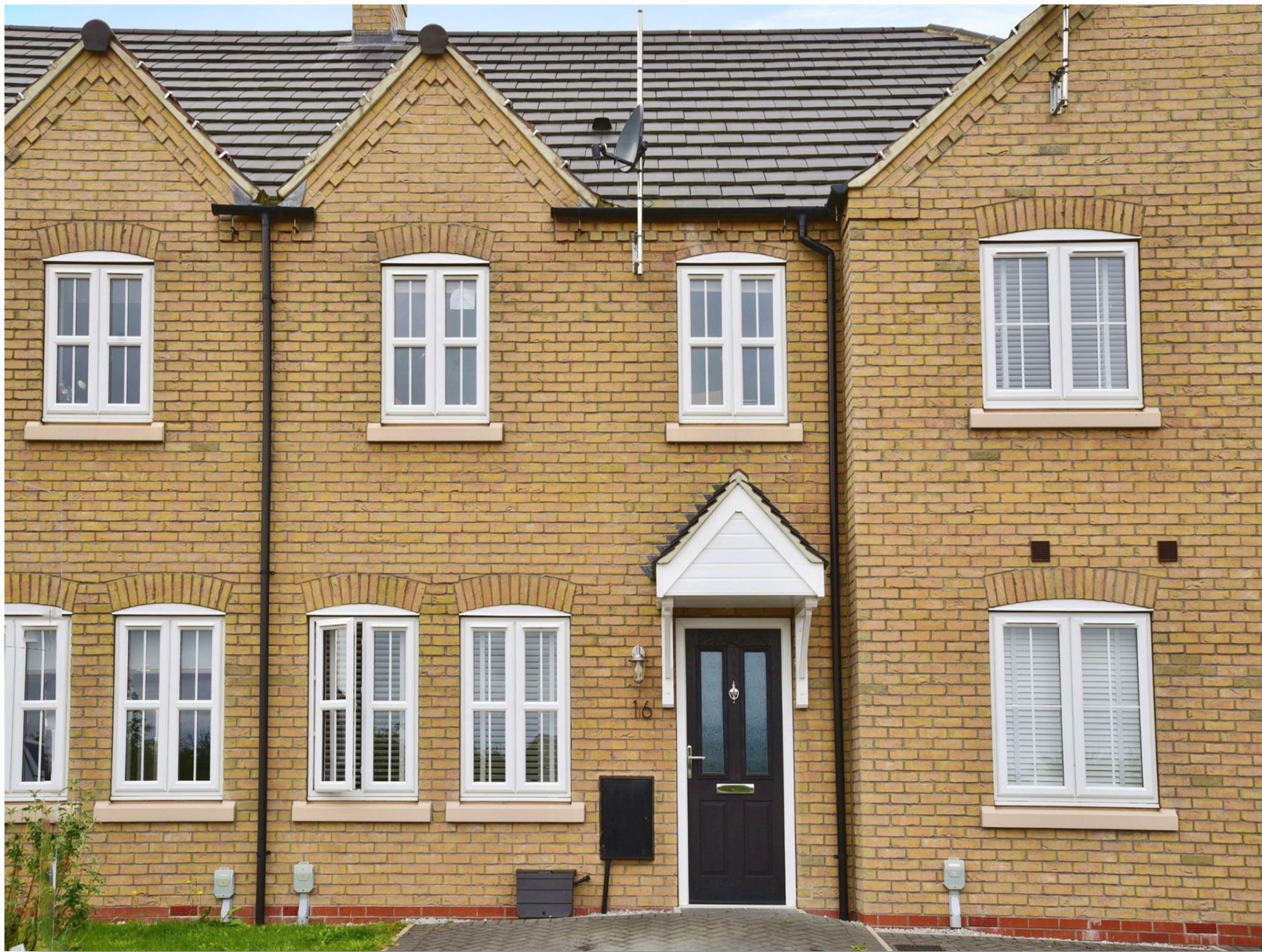
Thornbury Walk, Kingswood, Hull, HU7 3JY