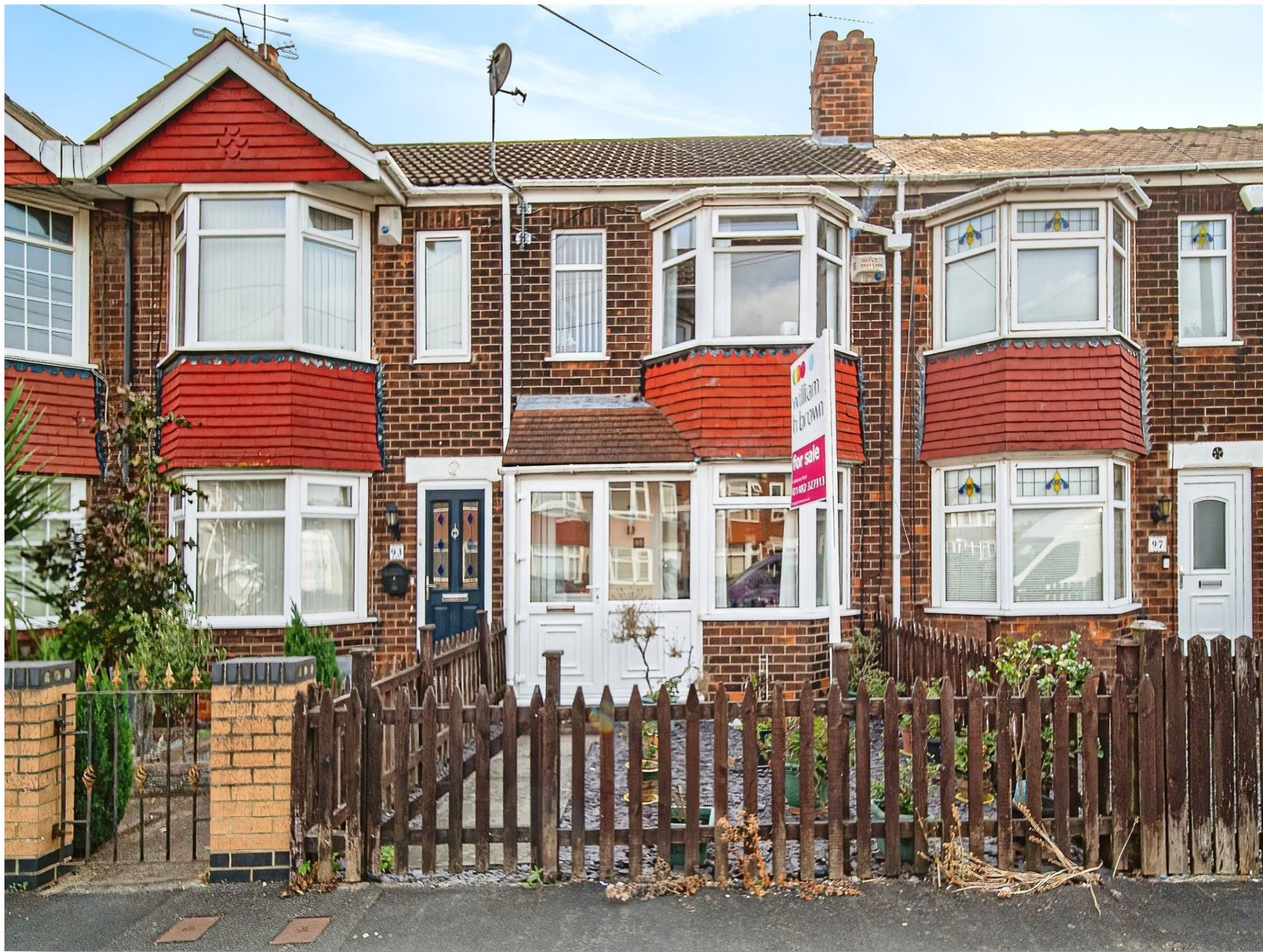
Foredyke Avenue, Hull HU7 0DT