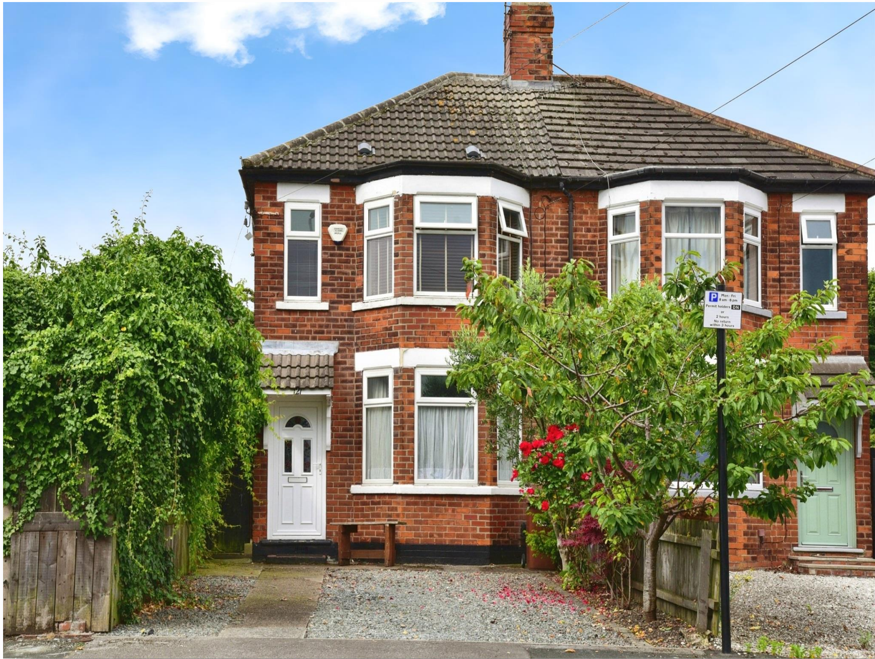
Dansom Lane North, Hull HU8 7RP