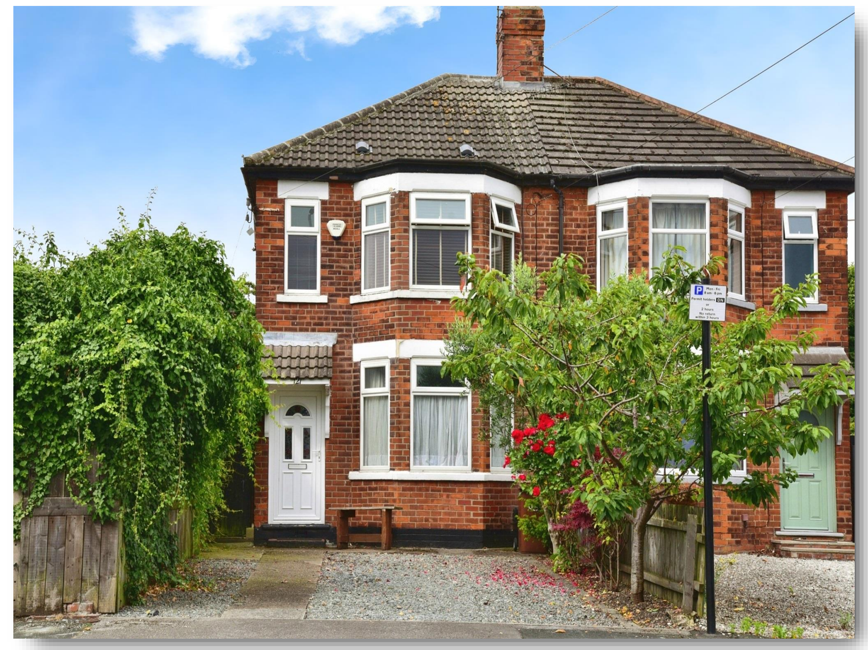
Dansom Lane North, Hull, HU8 7RP