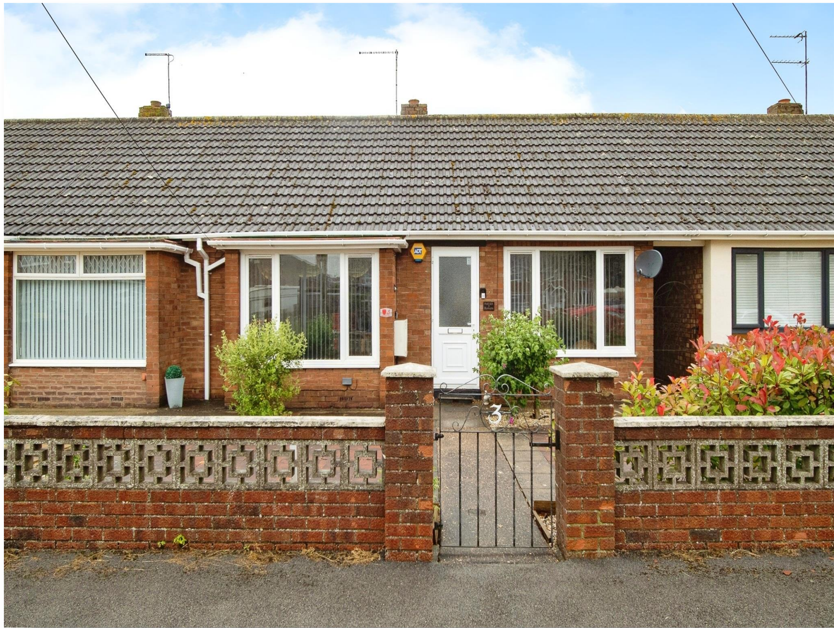
Hungerhills Drive, Bilton, Hull, HU11 4HH