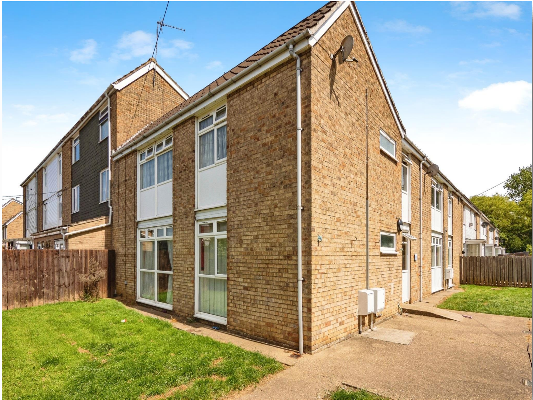
Gleneagles Park, Hull, HU8 9JR