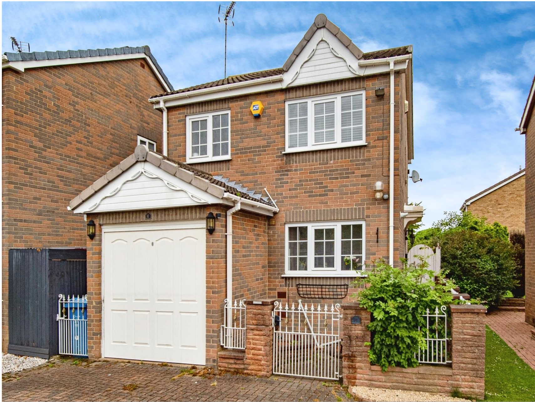
Oaktree Drive, Hull, HU8 9TS