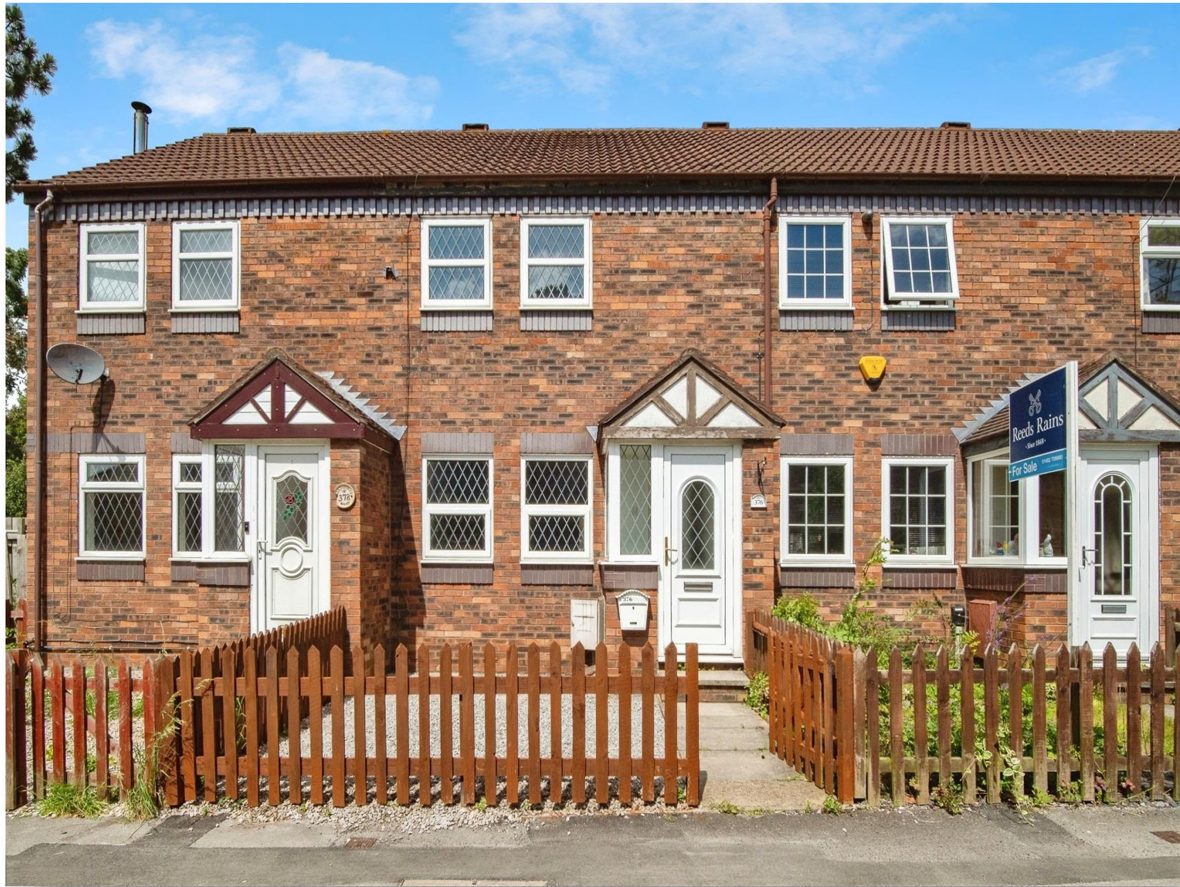
Saltshouse Road, Hull, HU8 9EY