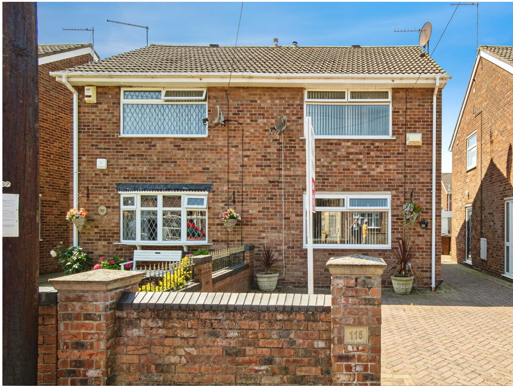
Green Island, Bilton, Hull, HU11 4EP