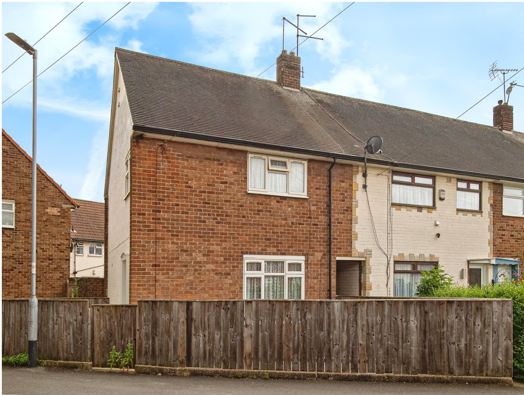
Longford Grove, Hull, HU9 4NG