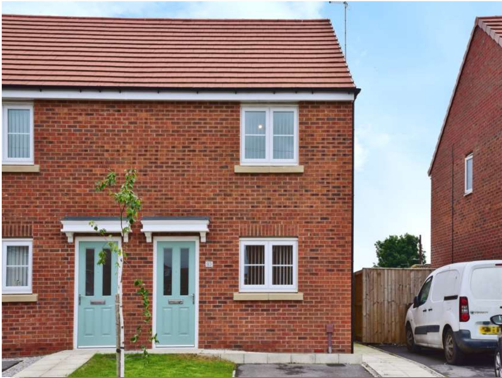
Waudby Way, Hull, HU9 4DG