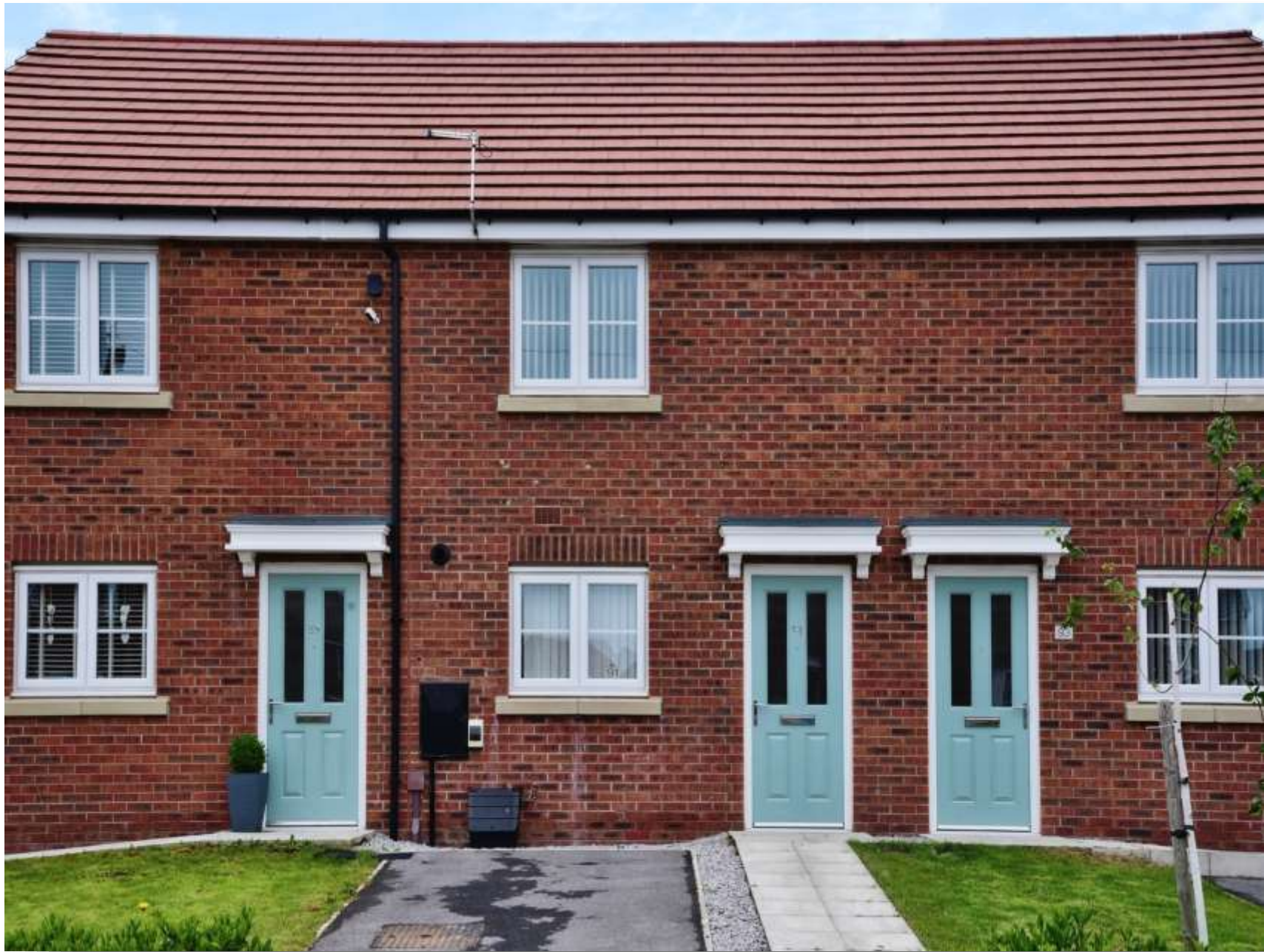
Waudby Way, Hull, HU9 4DG