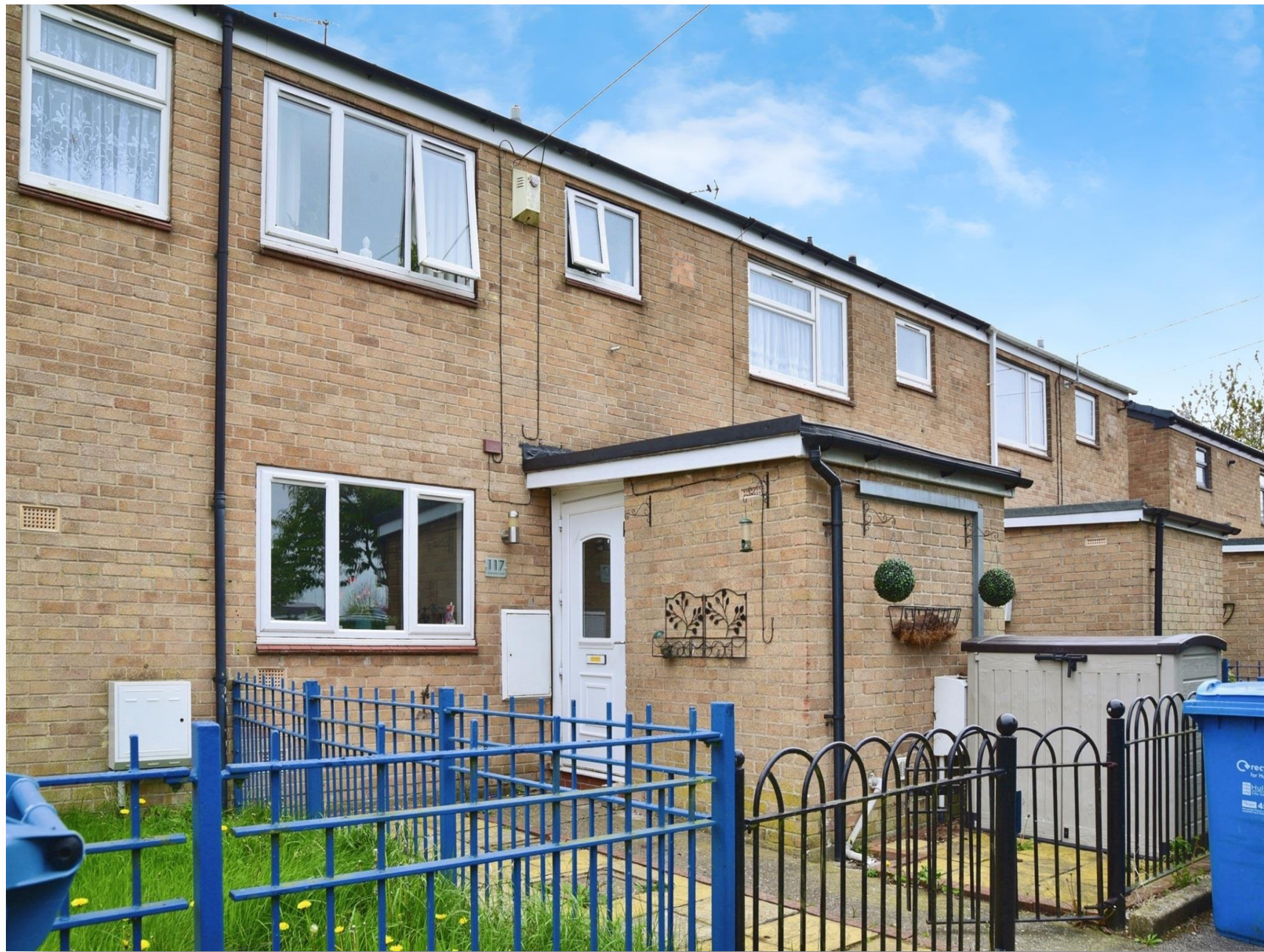
Scampton Garth, Bransholme, Hull, HU7 4RD