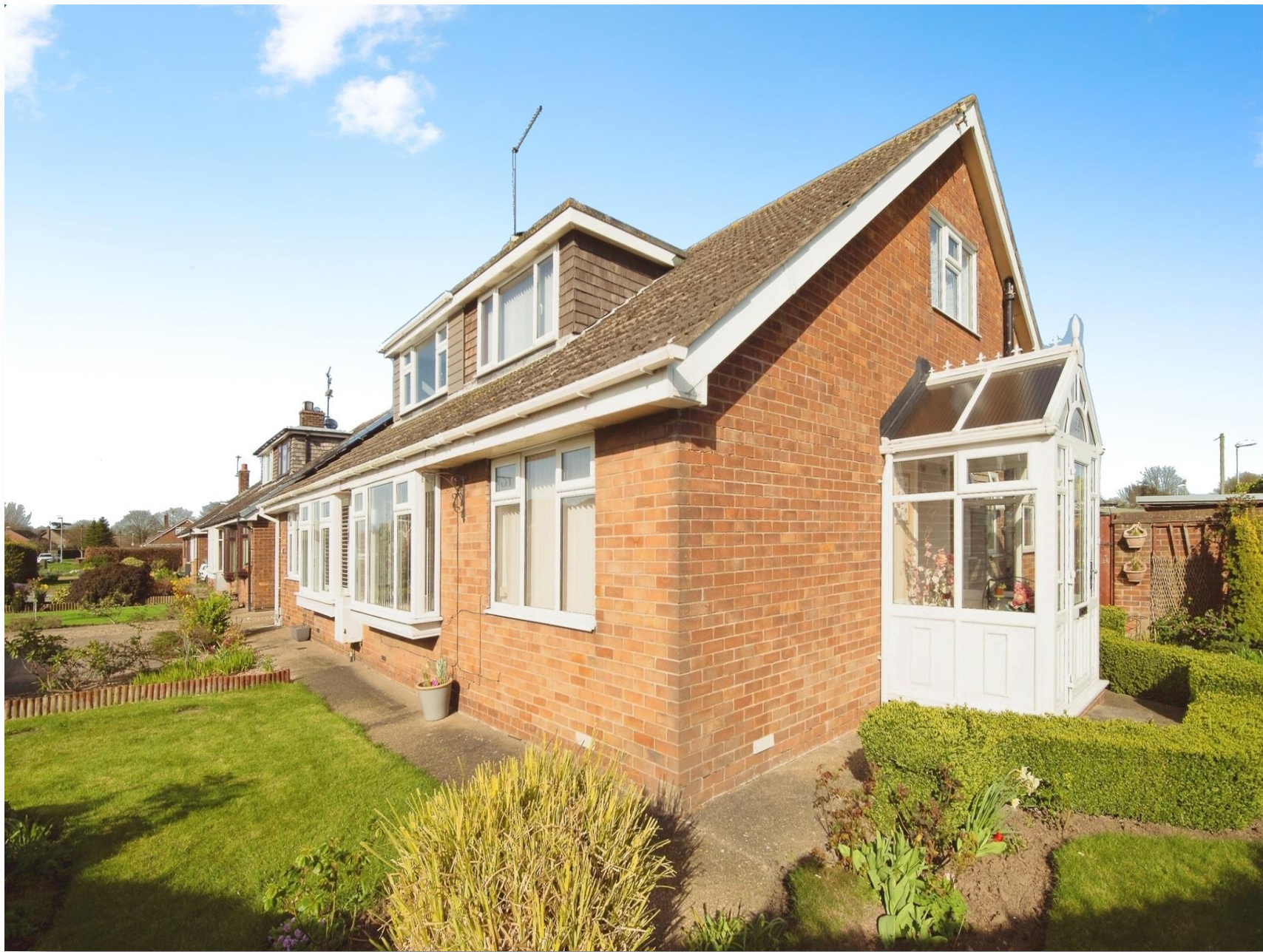
Hooks Lane, Thorngumbald, Hull, HU12 9QA